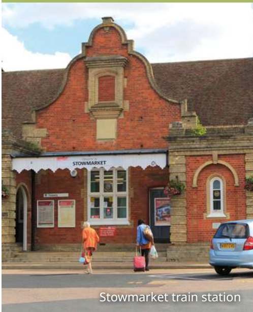
Stowmarket train station