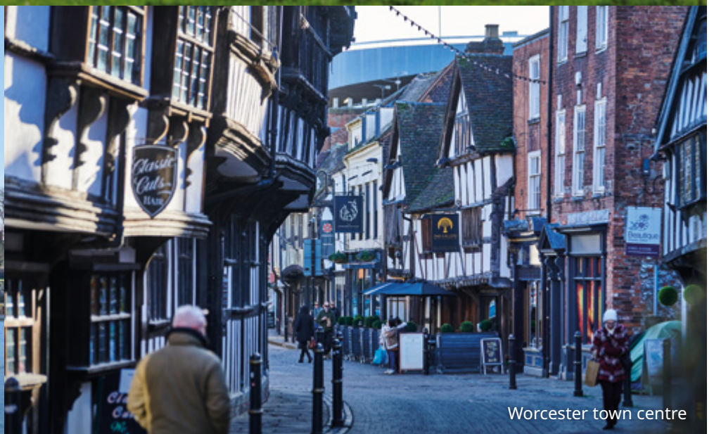
Worcester town centre