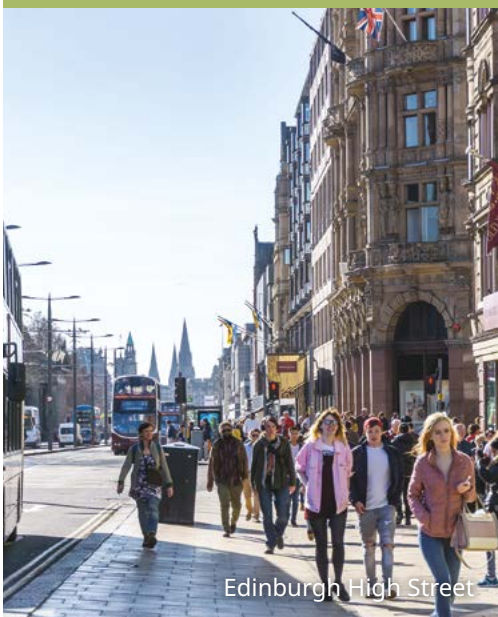
Edinburgh High Street