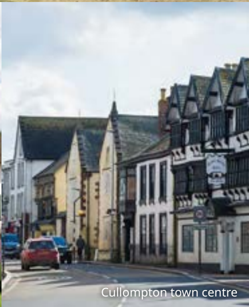
Cullompton town centre