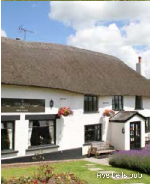
Five bells pub