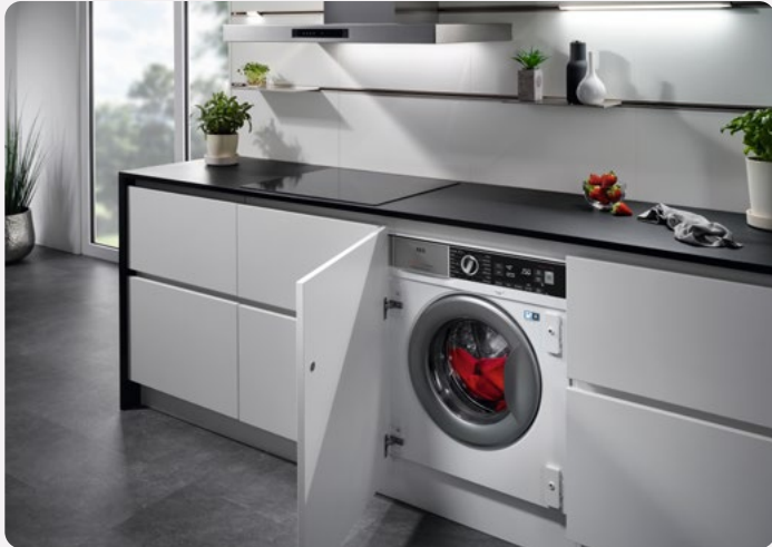
Options availability is subject to build stage of plots and options won't be available if plots have reached a certain build stage. Please contact the Sales Executive for further information.