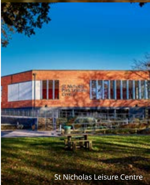
St Nicholas Leisure Centre