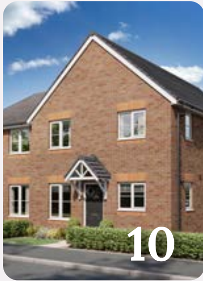
1 bedroom homes