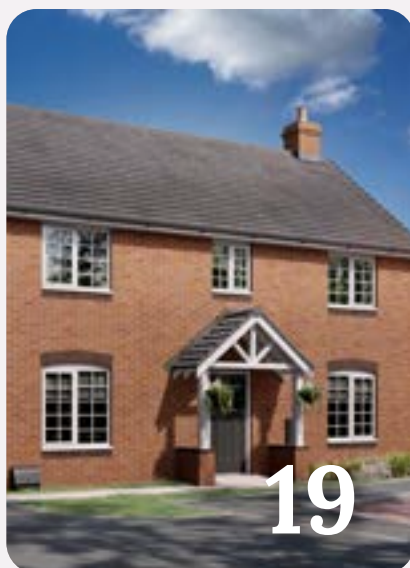
4 bedroom homes