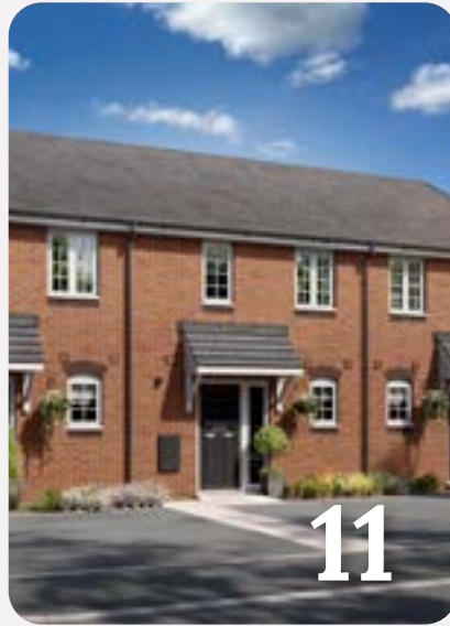
2 bedroom homes