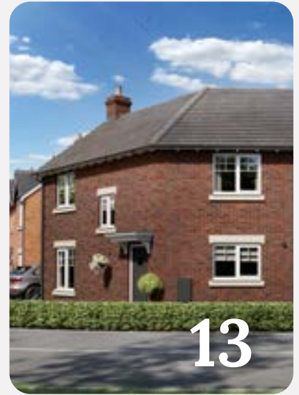
3 bedroom homes