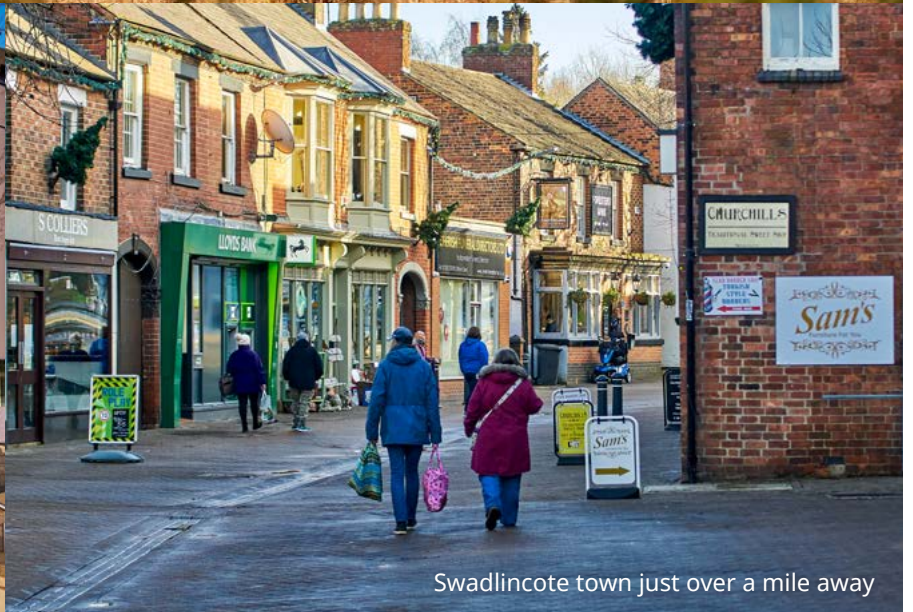
Swadlincote town just over a mile away