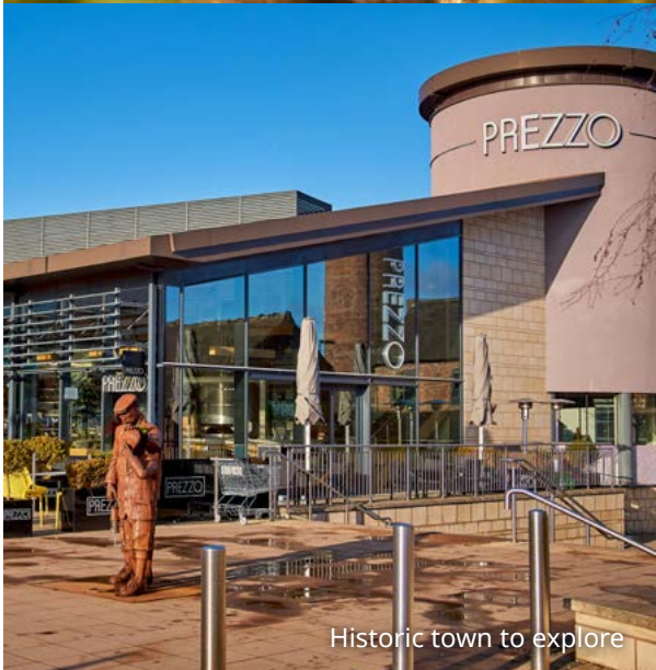
Historic town to explore