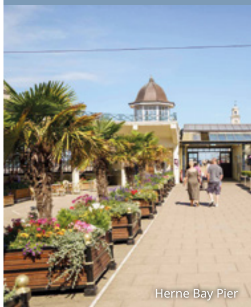
Herne Bay Pier