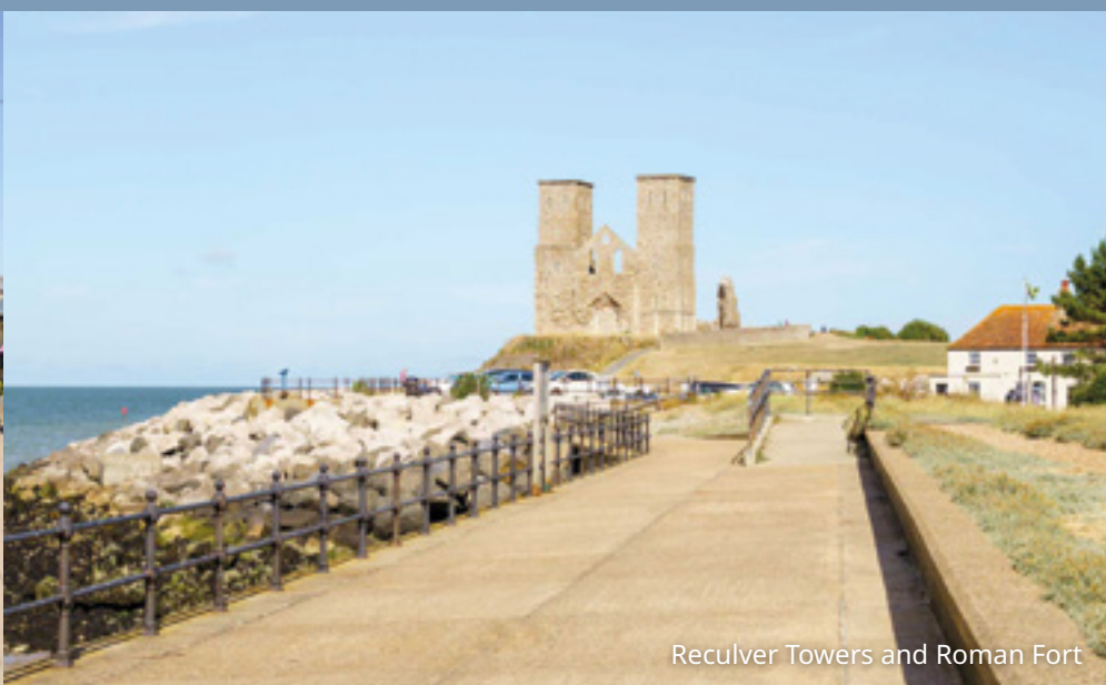
Reculver Towers and Roman Fort