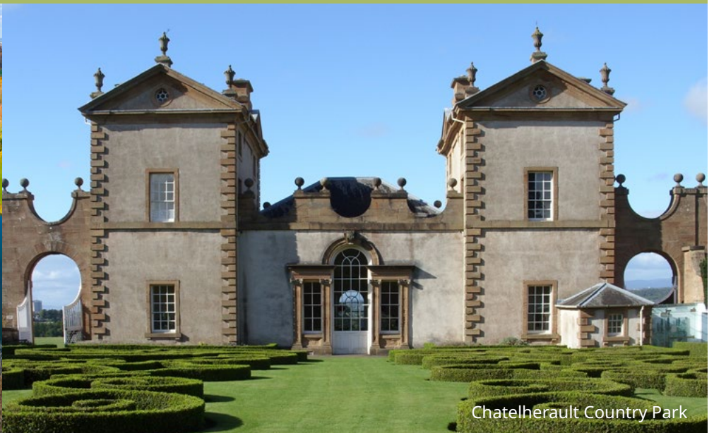
Chatelherault Country Park