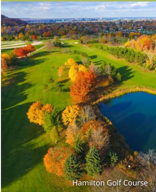
Hamilton Golf Course