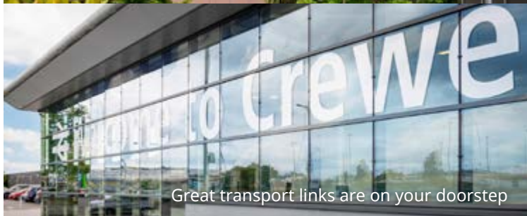
Great transport links are on your doorstep