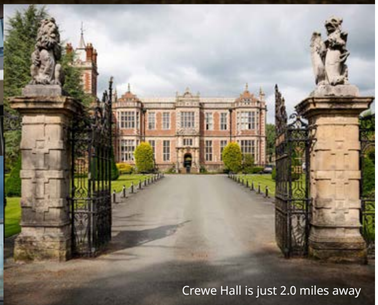
Crewe Hall is just 2.0 miles away