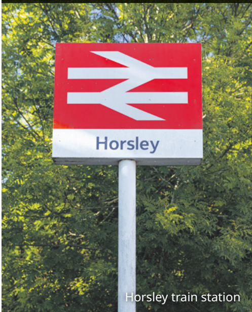
Horsley train station