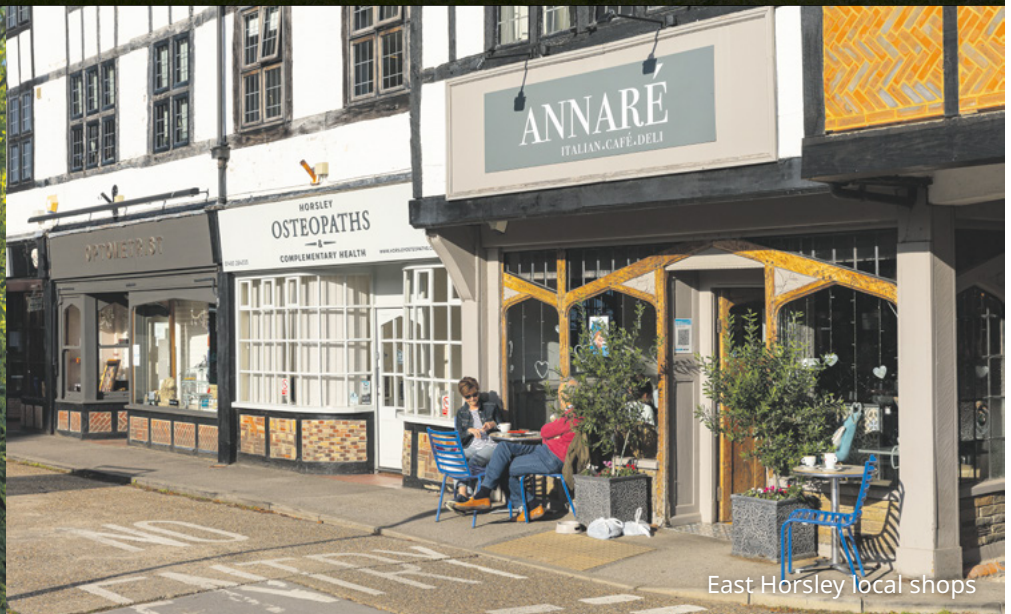
East Horsley local shops