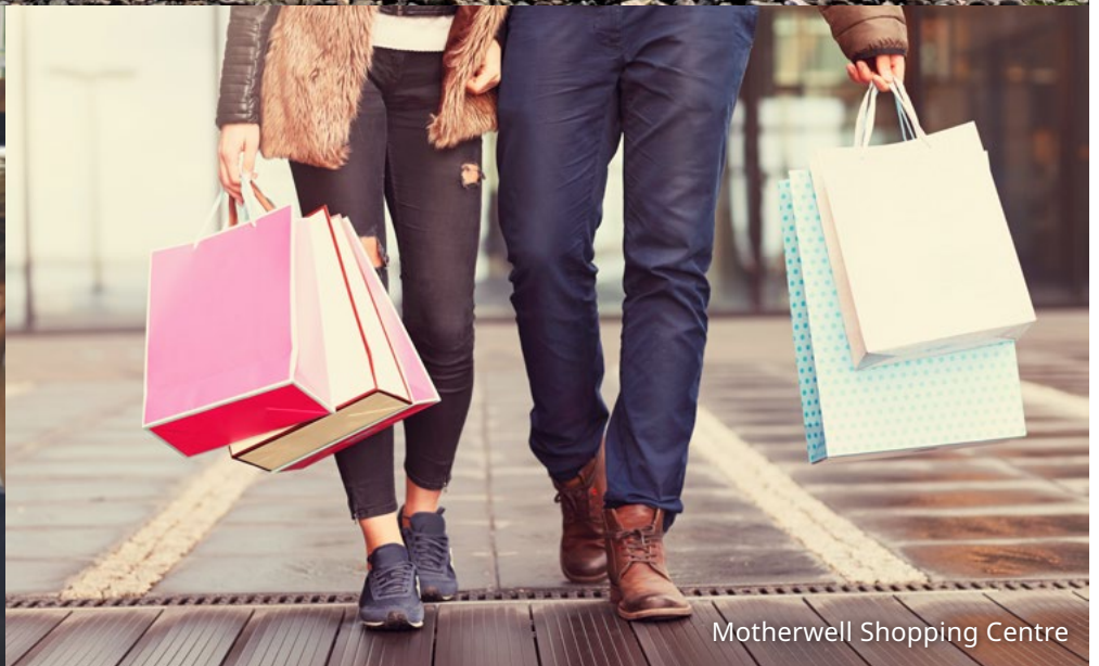
Motherwell Shopping Centre