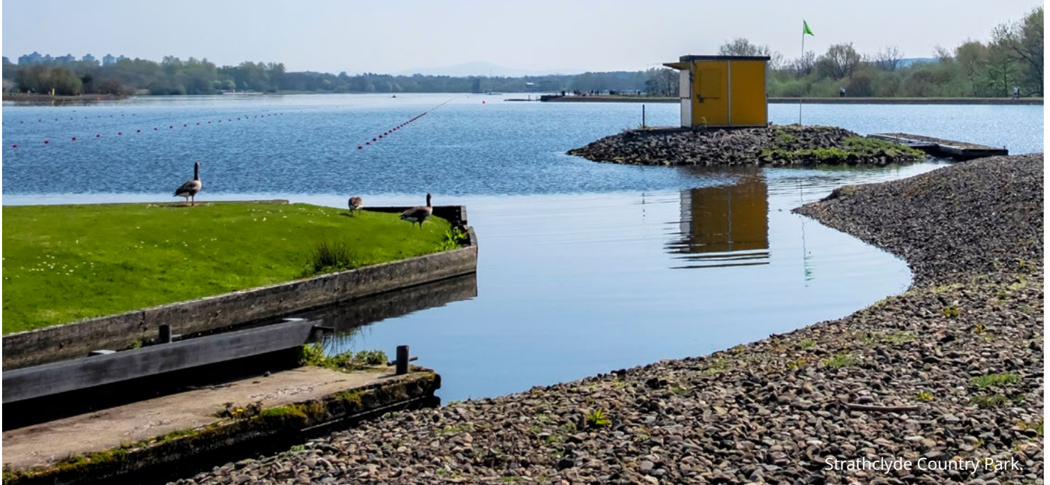
Strathclyde Country Park

Of course, home life is only part of the story. You'll want stress-free links to other parts of the country too. So, it's good to know that Torrance Place has excellent transport links with easy access to the M73, M74 and M8 to Glasgow and Edinburgh. Holytown train station is just 2 miles from the development and can whisk you into Glasgow Central Station in under 30 minutes, which is perfect for those who are looking to commute to the city.