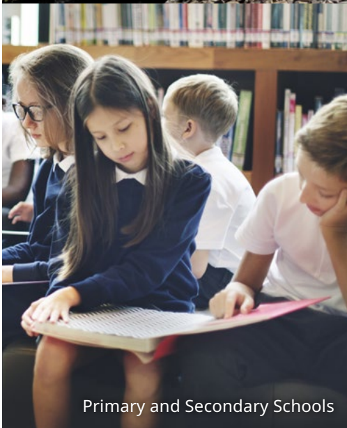
Primary and Secondary Schools