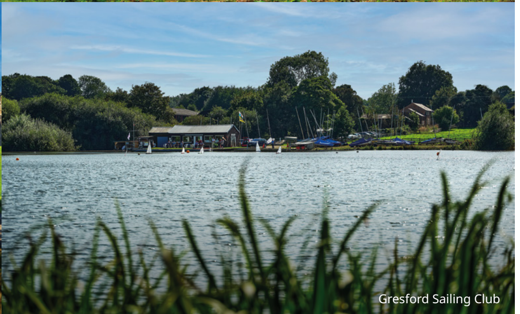
Gresford Sailing Club