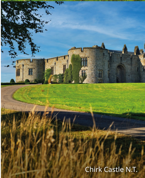
Chirk Castle N.T.