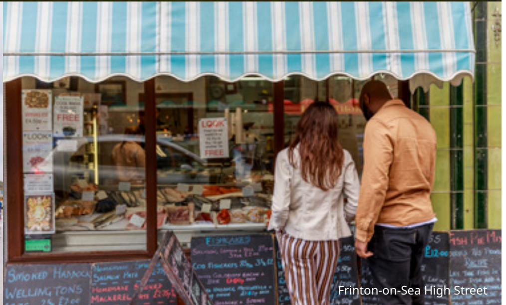
Frinton-on-Sea High Street