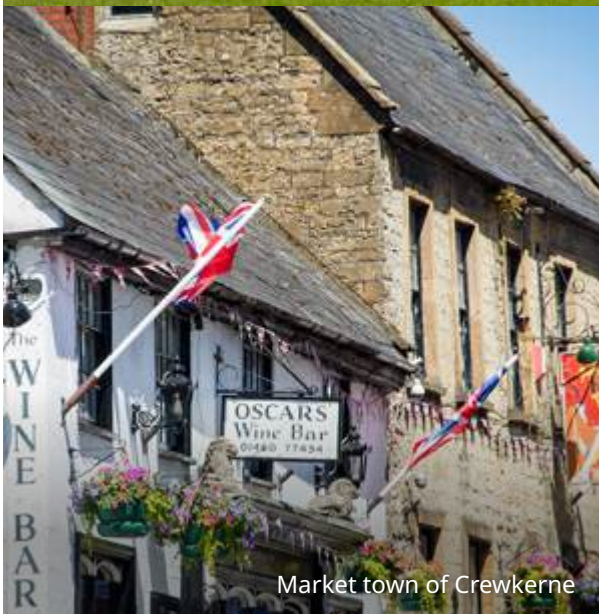
Market town of Crewkerne