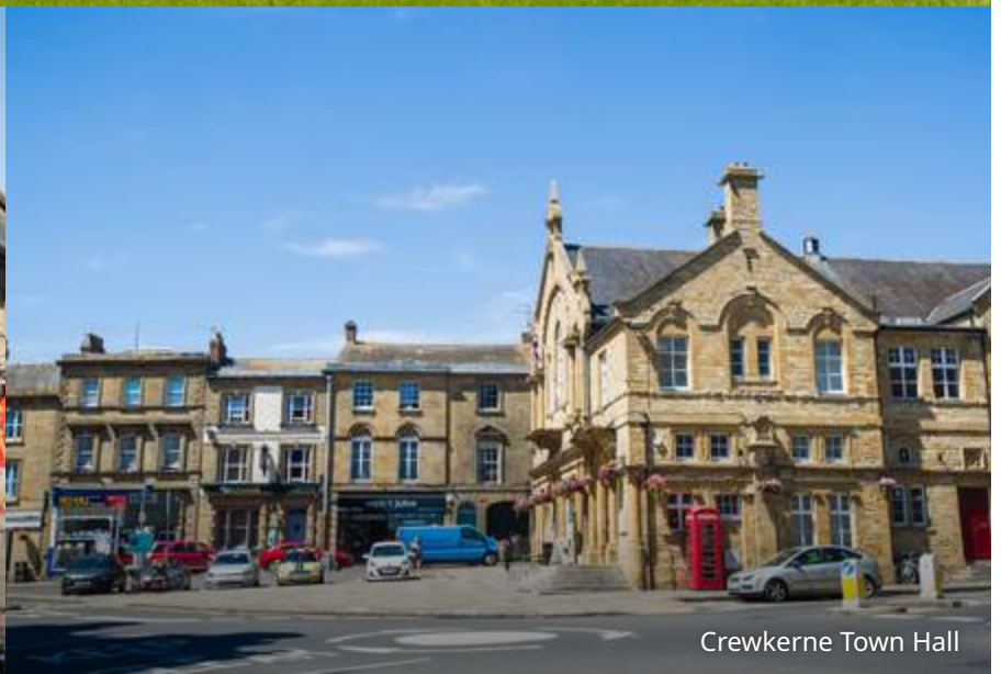
Crewkerne Town Hall