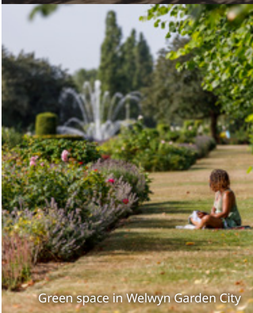
Green space in Welwyn Garden City