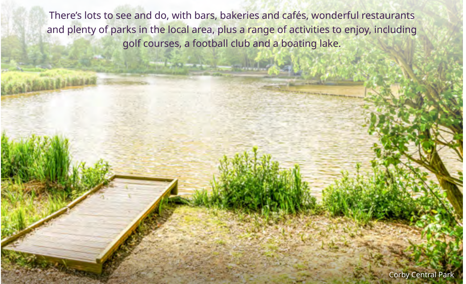
Corby Central Park

There's lots to see and do, with bars, bakeries and cafés, wonderful restaurants and plenty of parks in the local area, plus a range of activities to enjoy, including golf courses, a football club and a boating lake.