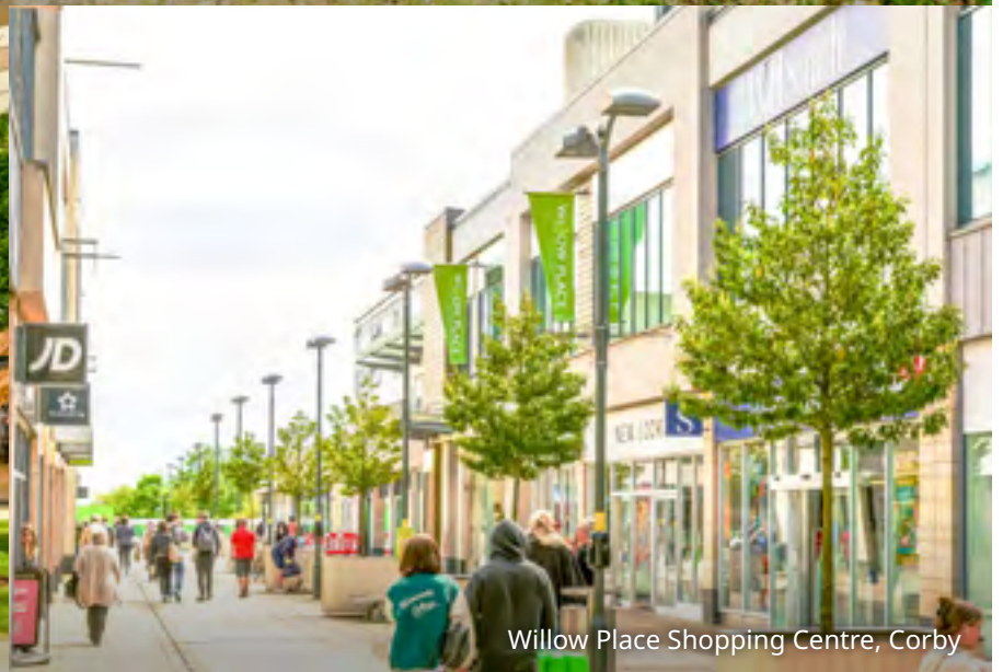
Willow Place Shopping Centre, Corby