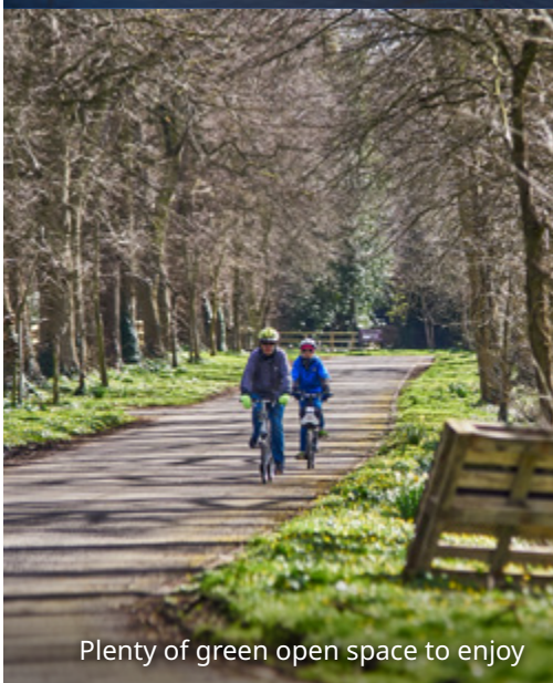
Plenty of green open space to enjoy