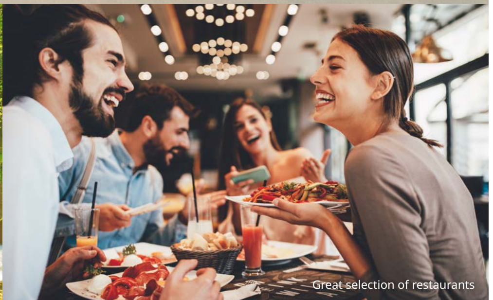
Great selection of restaurants