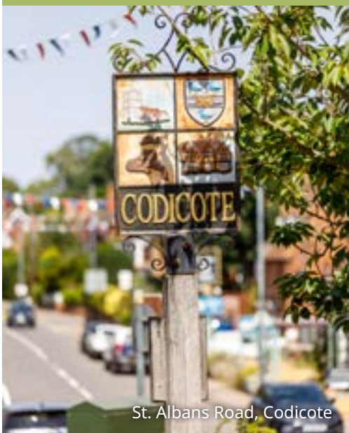
St. Albans Road, Codicote