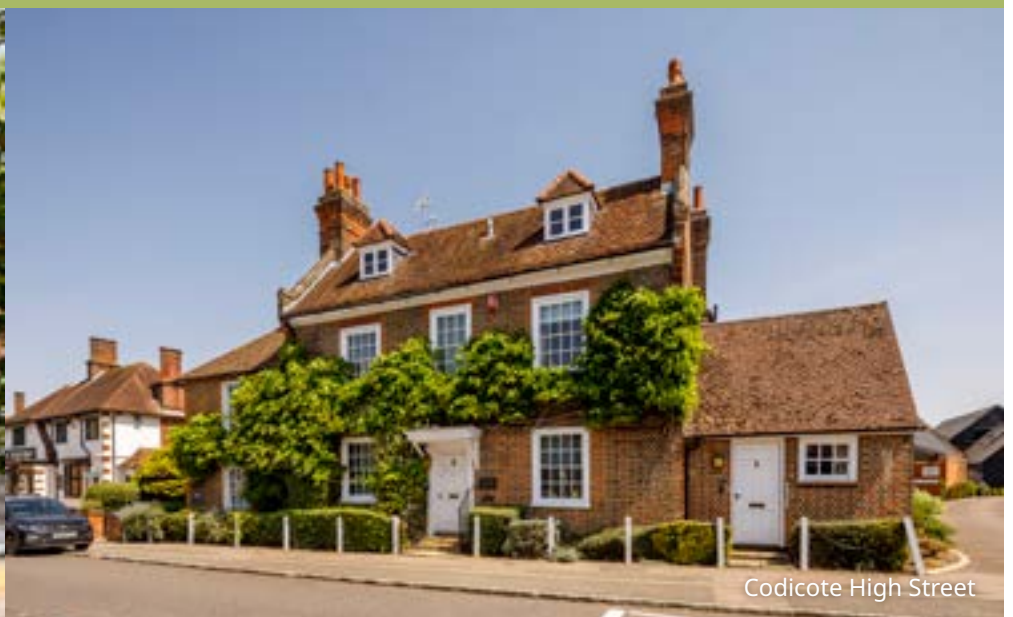
Codicote High Street