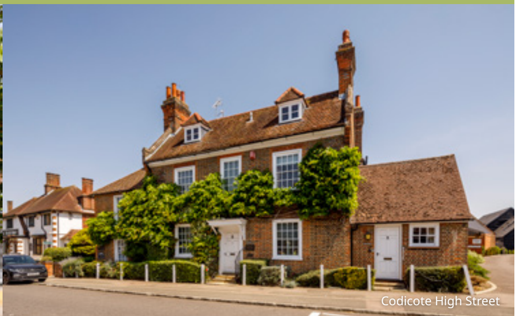
Codicote High Street