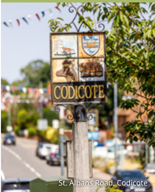
St. Albans Road, Codicote