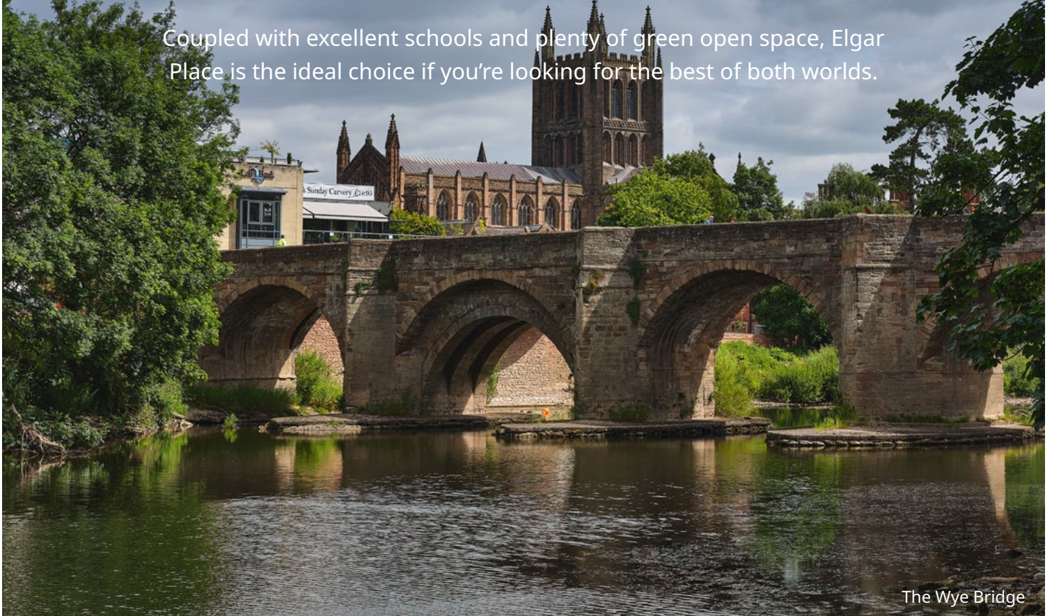
The Wye Bridge

Coupled with excellent schools and plenty of green open space, Elgar Place is the ideal choice if you're looking for the best of both worlds.