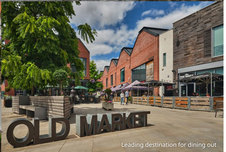
Leading destination for dining out