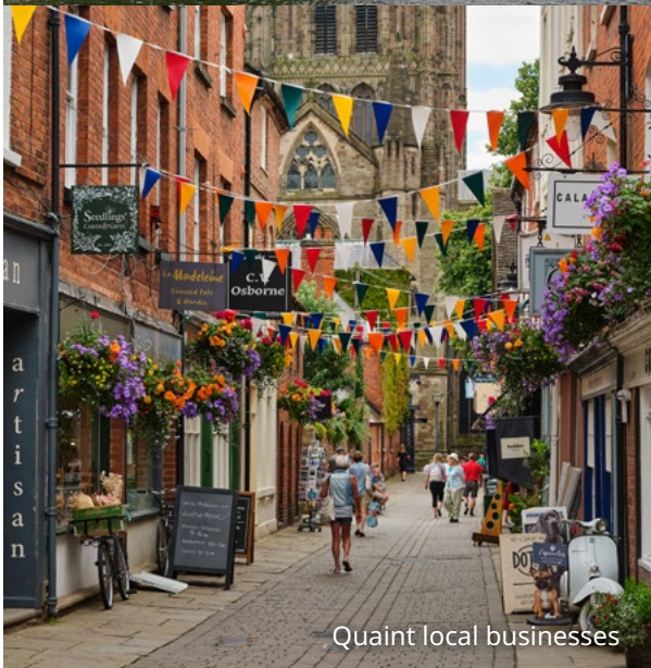
Quaint local businesses