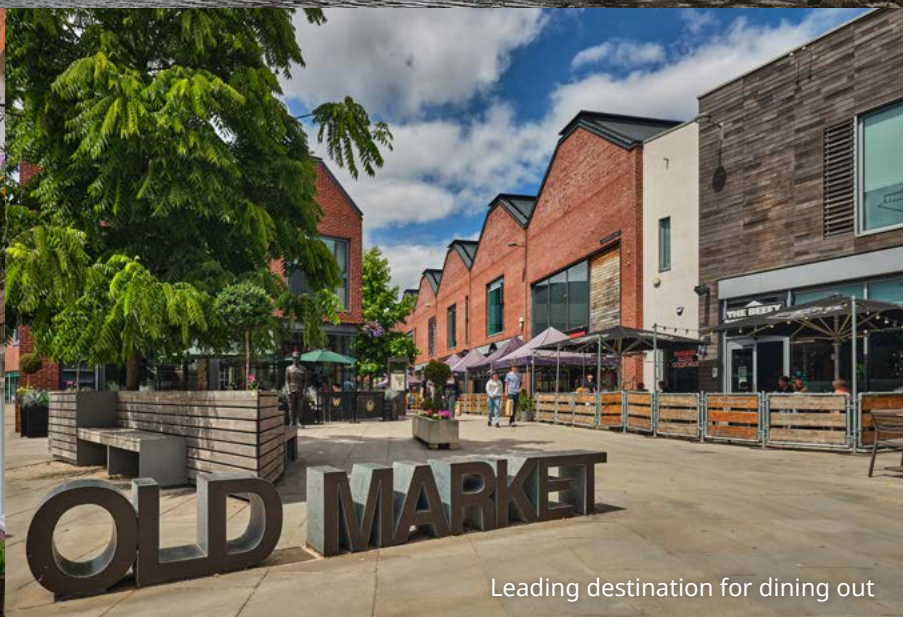
Leading destination for dining out