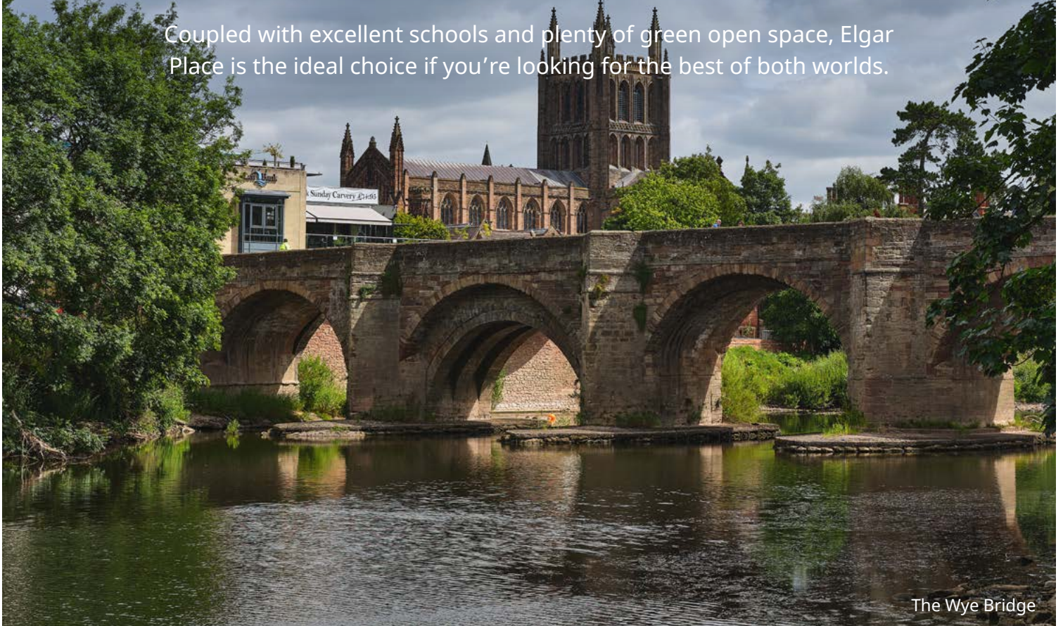
The Wye Bridge

Coupled with excellent schools and plenty of green open space, Elgar Place is the ideal choice if you're looking for the best of both worlds.