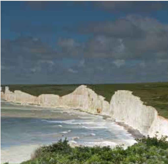
SOUTH DOWNS NATIONAL PARK 39 miles – 45 mins