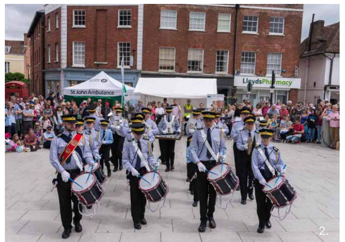
1: Wimborne Market 2: Wimborne Folk Festival Adjacent page: Wimborne Medieval Church