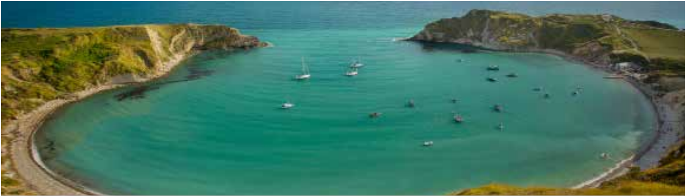
LULWORTH COVE, DURDLE DOOR 23.2 miles – 40 mins