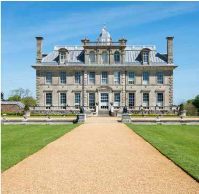
KINGSTON LACY COUNTRY HOUSE & ESTATE BH21 4AE / 3.0 miles - 10 mins