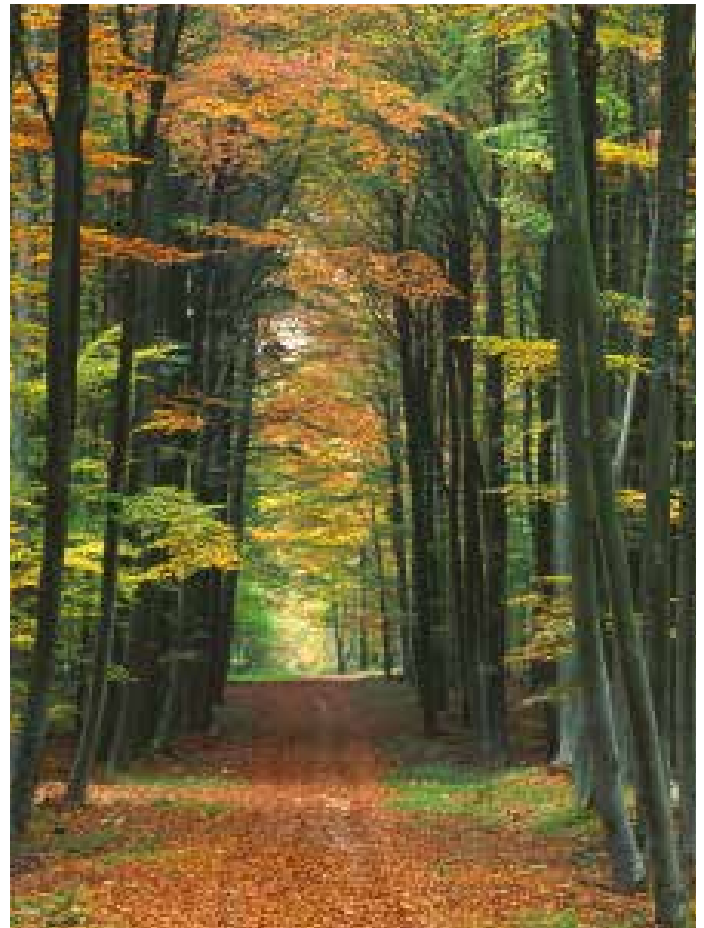
NEW FOREST NATIONAL PARK 13.3 miles – 20 mins