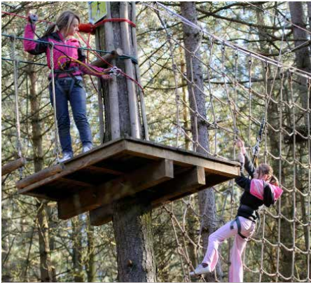
GO APE MOORS VALLEY BH24 2ET / 8.0 miles - 20 mins