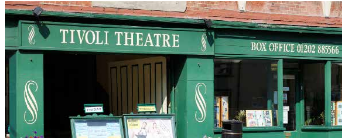
TIVOLI THEATRE BH21 1LT / 1.5 miles - 7 mins