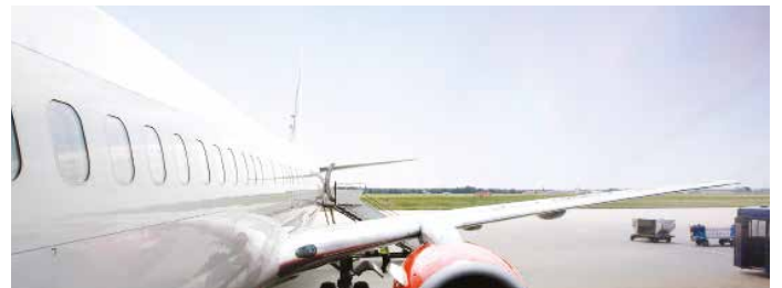
BOURNEMOUTH AIRPORT BH23 6SE / 7.8 miles - 15 mins