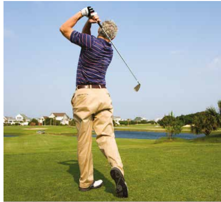
FERNDOWN FOREST GOLF CLUB BH22 9PH / 4.1 miles - 10 mins