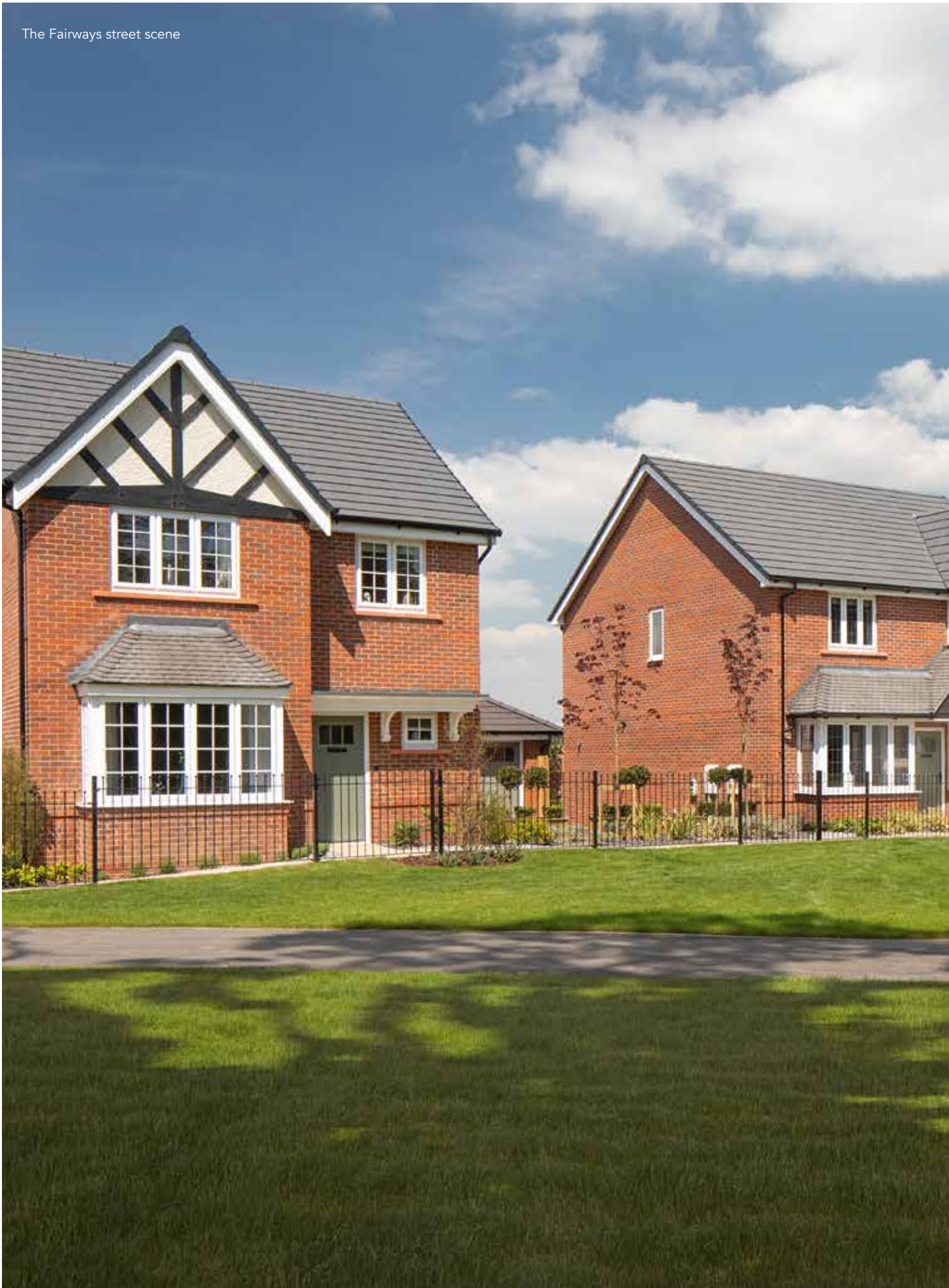
The Fairways street scene