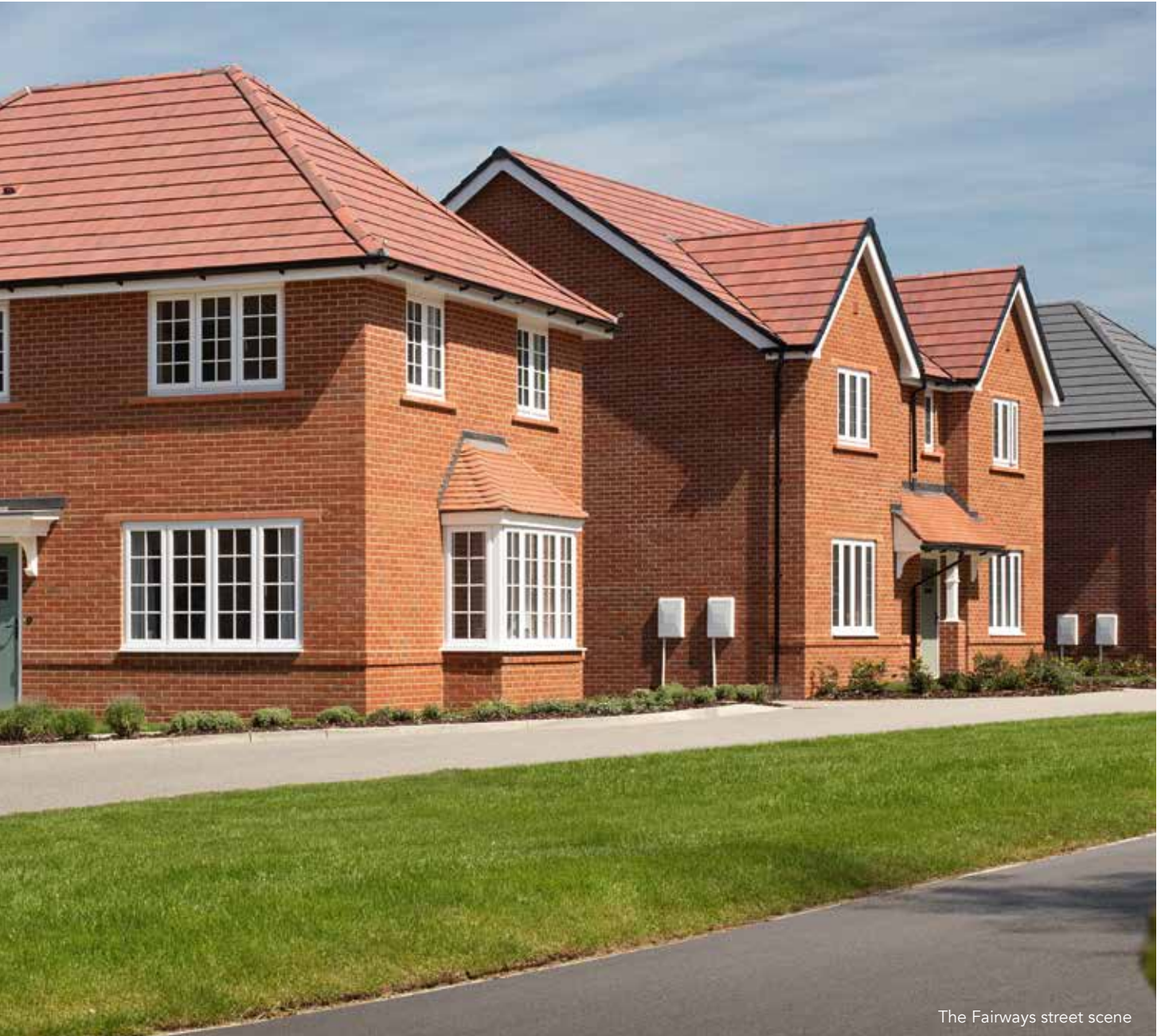
The Fairways street scene