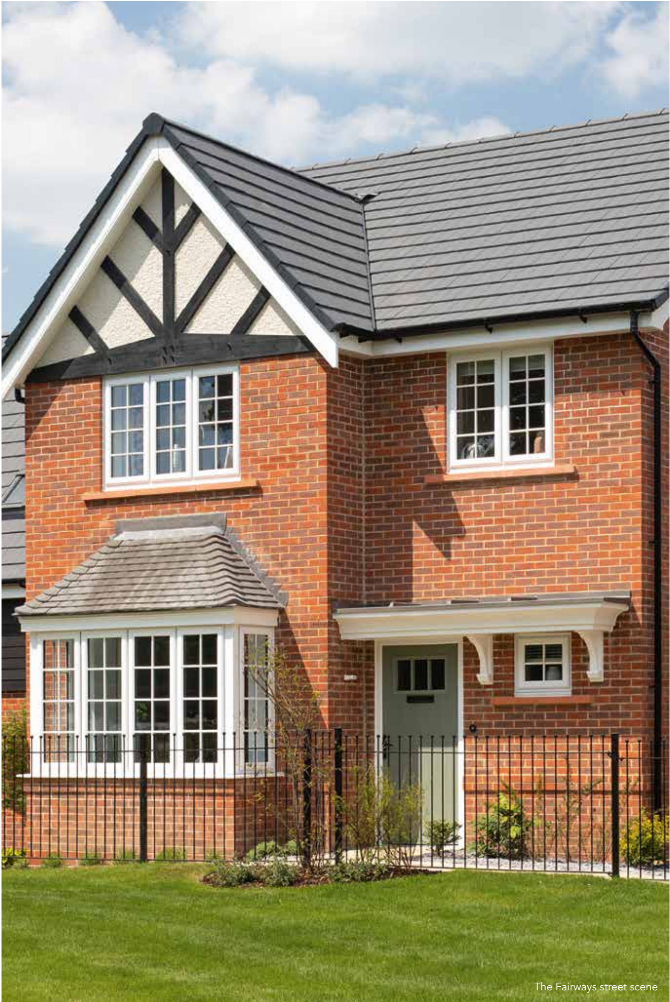
The Fairways street scene