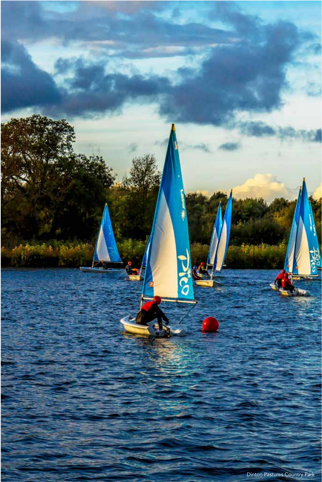
Dinton Pastures Country Park