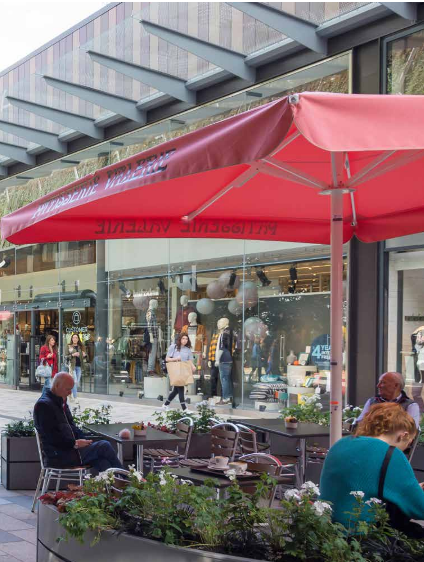
Above: The Lexicon, Bracknell