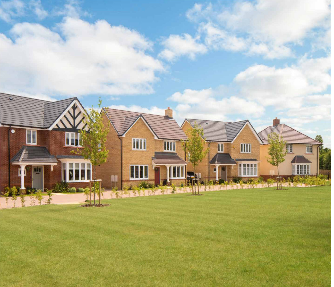
Above: A typical Bloor Homes street scene

THE NUMBER OF DREAMS WE MADE REALITY LAST YEAR*