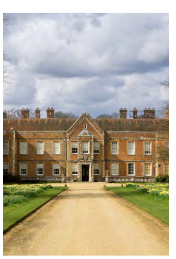
▲ 9 MILES