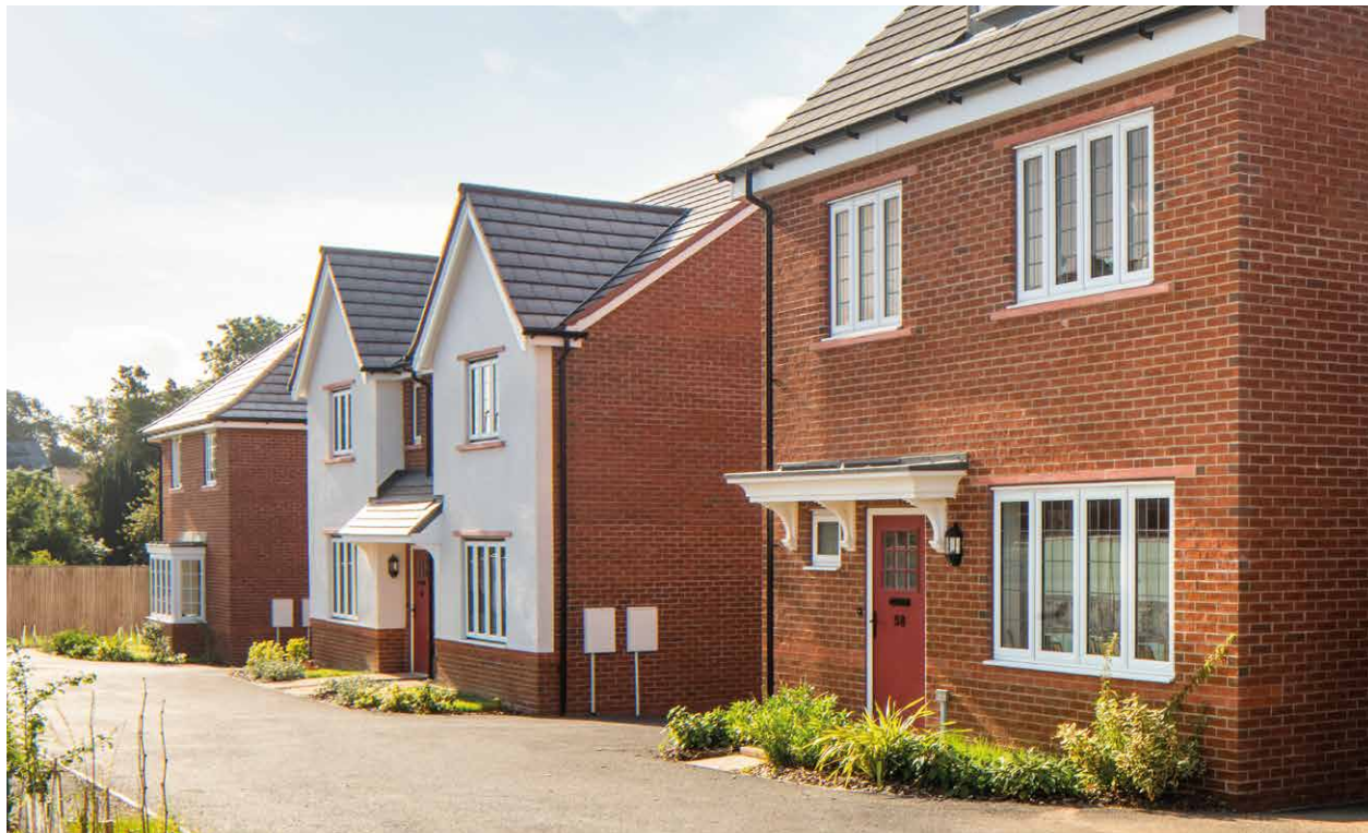
The Beefy Boys 01 Hereford Point 02 street scene

Distances and journey times calculated using maps.google.com