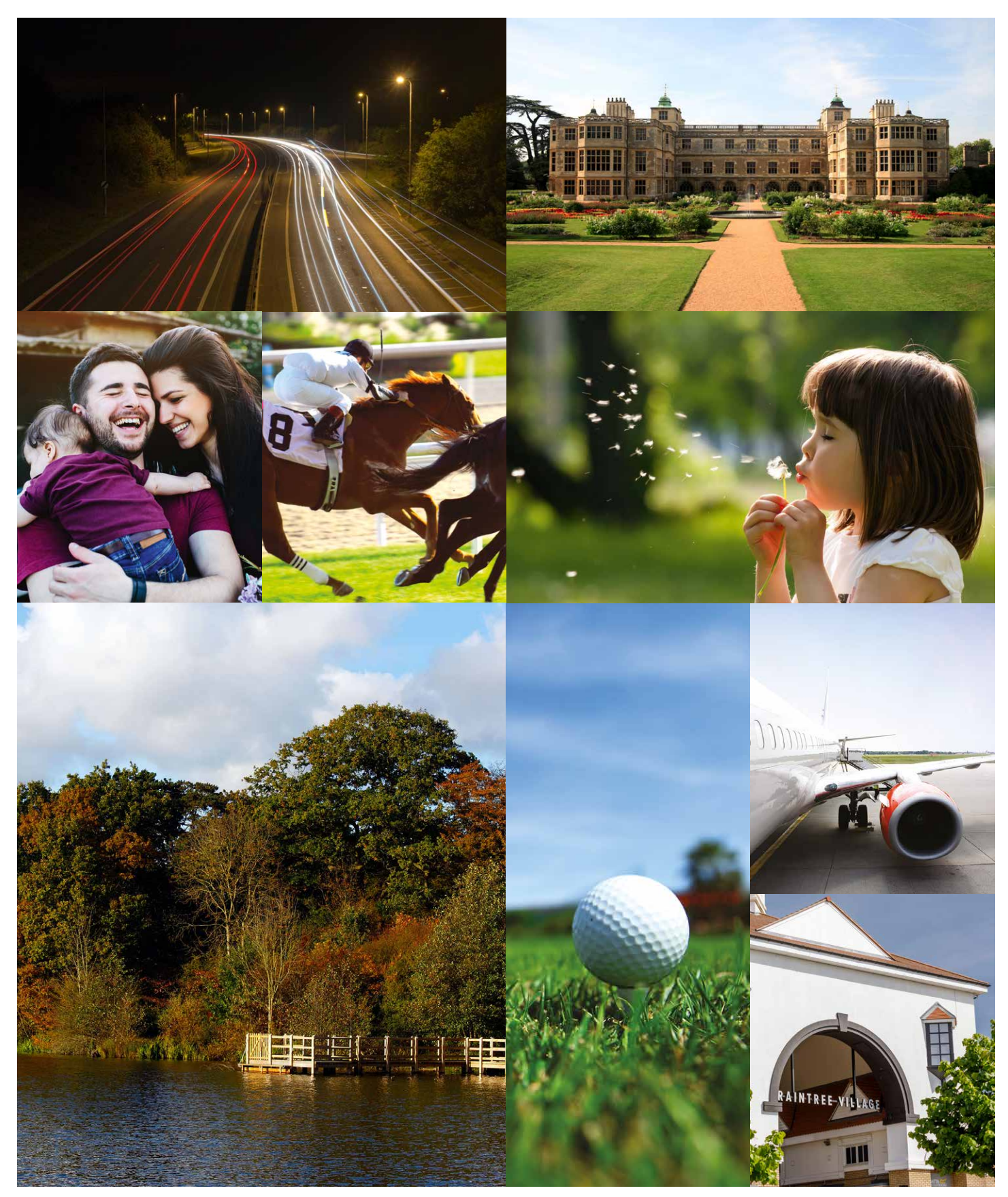
\hookrightarrow Images for illustration purposes only.