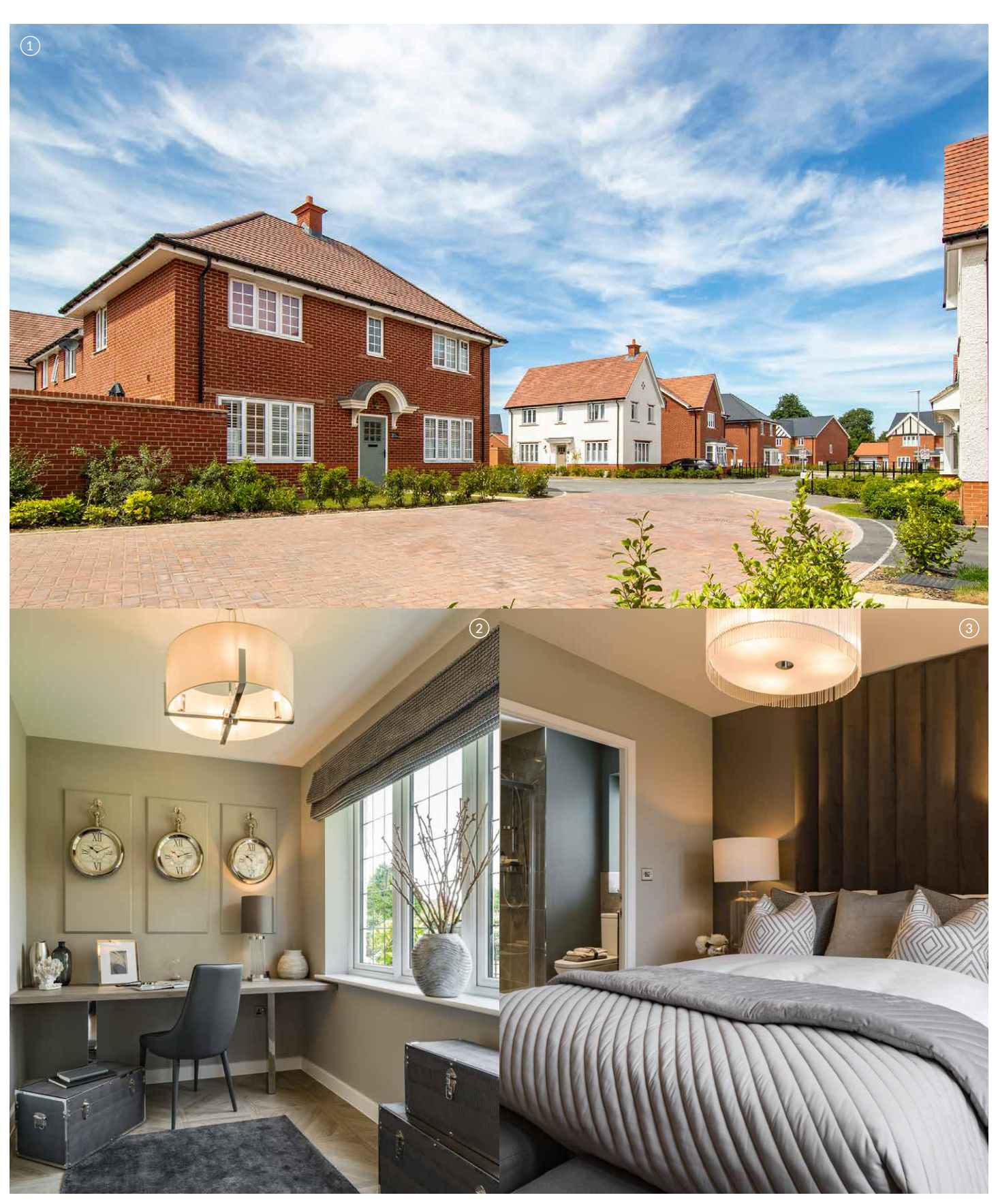
\bigcirc Bloor Homes at Feering