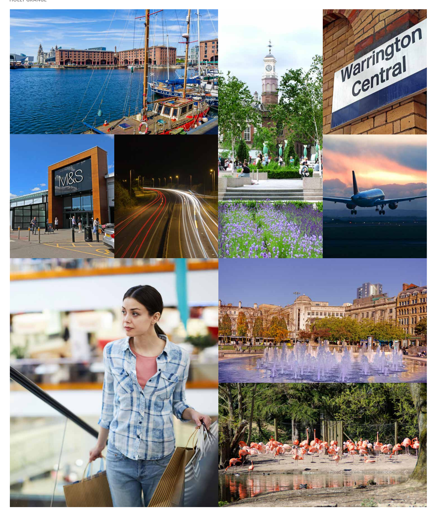
\hookrightarrow Images for illustration purposes only.