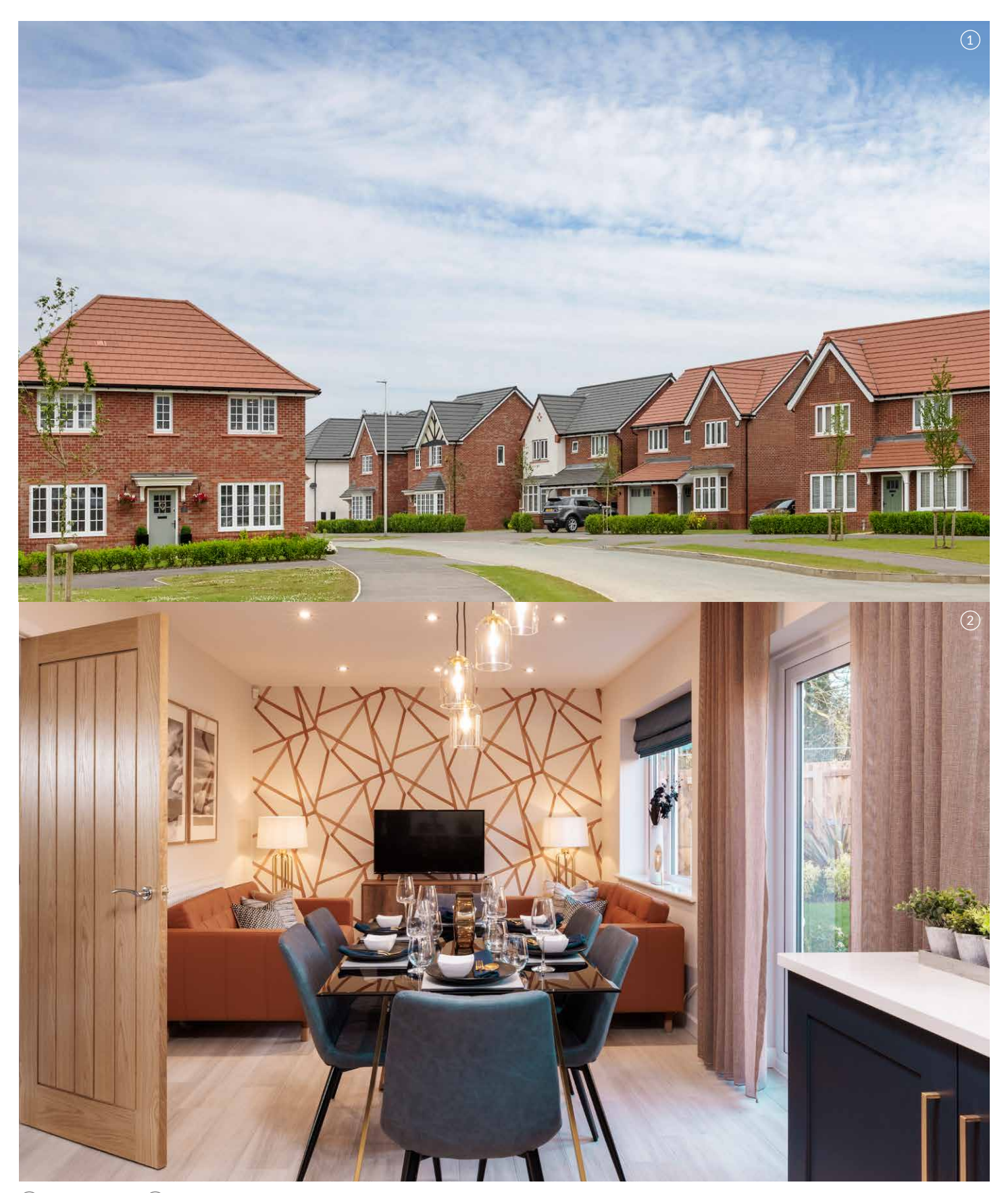
\hookrightarrow Beamish Place 2 \hookrightarrow Typical Interior