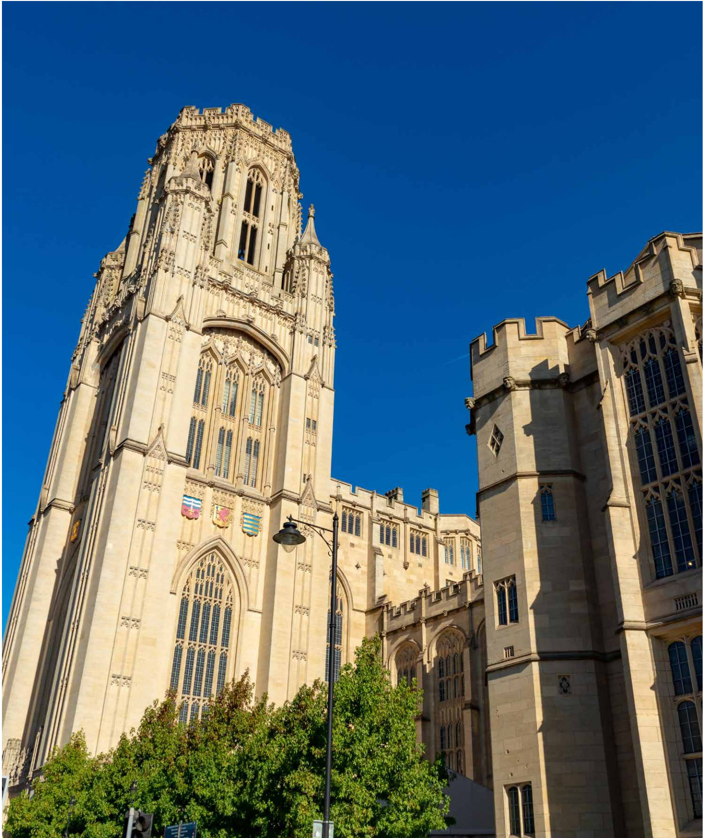
↳ University of Bristol