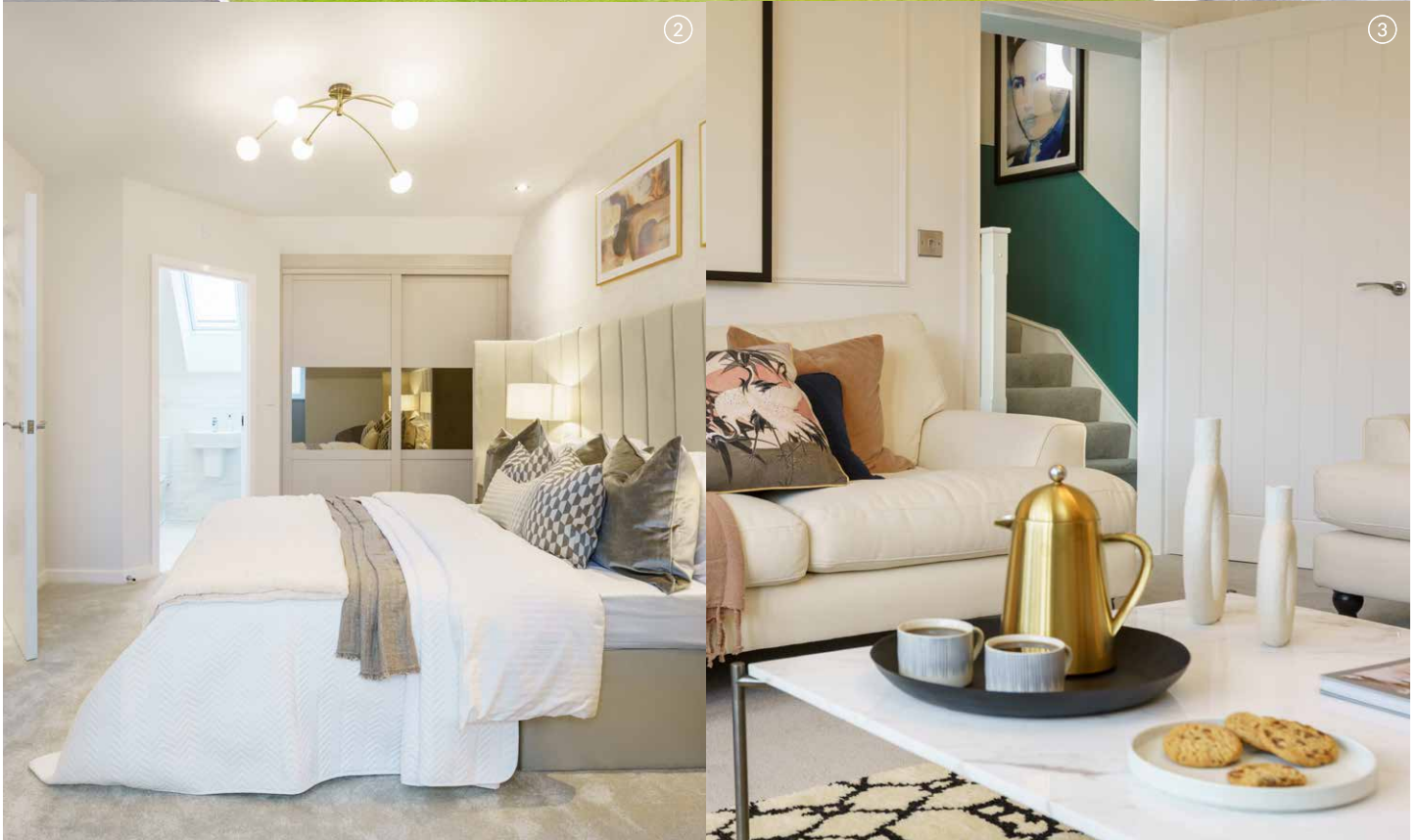
① ↳ The Fairways, Bindfield