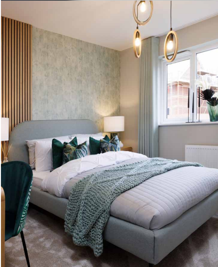
↳ Typical Interiors

Most of us don't regularly buy a new home, so it's no wonder it can seem a little confusing at times. But it's not as scary as you might think, we'll hold your hand through the entire buying process. After all, we've been doing this for fifty years.