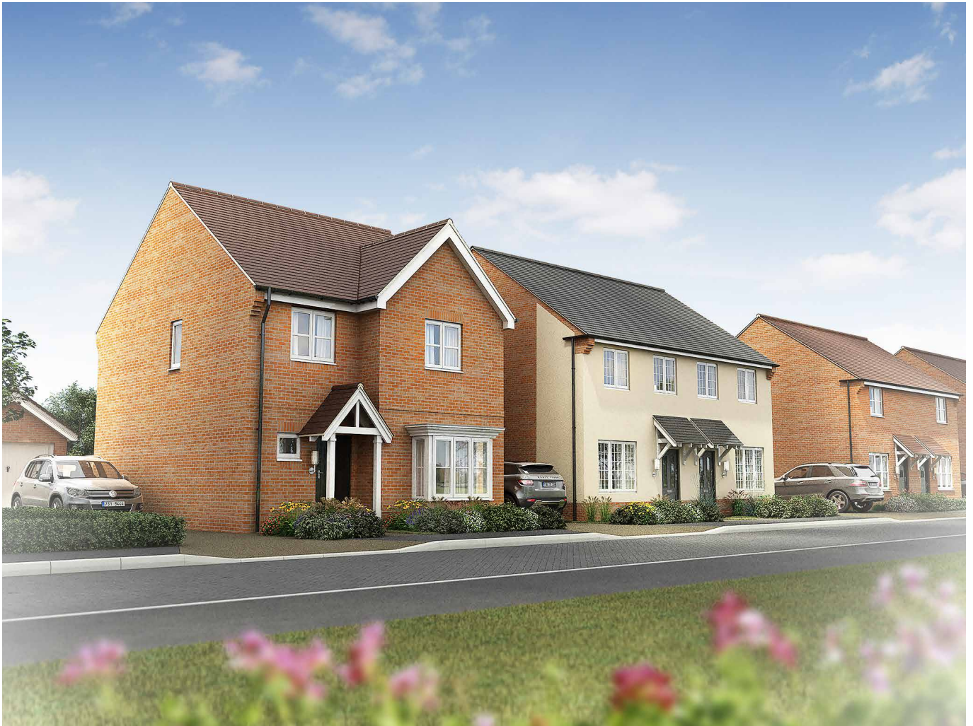
Above: Artist's impression of Trinity Meadows

Trinity Meadows is a superior collection of new homes within the established Suffolk village of Stowupland, two miles north-east of the market town of Stowmarket and within easy access of the A14.