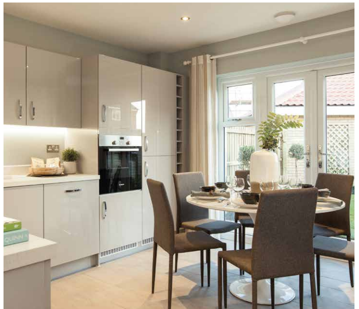
Above: The Studland at Marham Park, Bury St Edmunds

We hope you'll never need it, but we understand the peace of mind that comes with having a Bloor Homes two year warranty and an insurance-backed 10 year guarantee from the NHBC. As well as our own rigorous checks carried out during the build process, the NHBC will also carry out their own inspections on your new home ensuring that it's built to the high quality that Bloor Homes prides itself on.