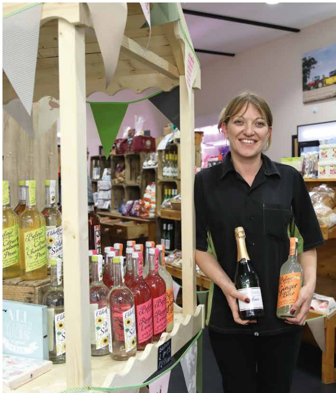
Above: Mr Allards Farm Shop, Stowupland Right: Stowupland village

For those with younger families, there is a baby and toddler group and a children's play park on Church Road.