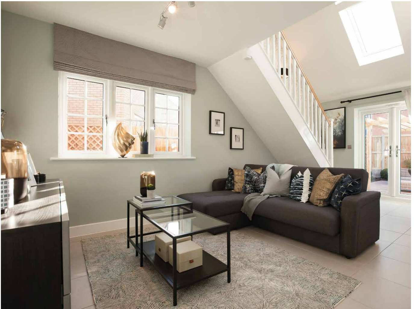
Above: Caulke Show Home at Marham Park, Bury St Edmunds

Our Sales Advisors are trained and on hand to offer you the best possible advice and support when purchasing your new home. Our after-sales team also ensures you continue to be happy with your choice of a new Bloor home for many years to come.