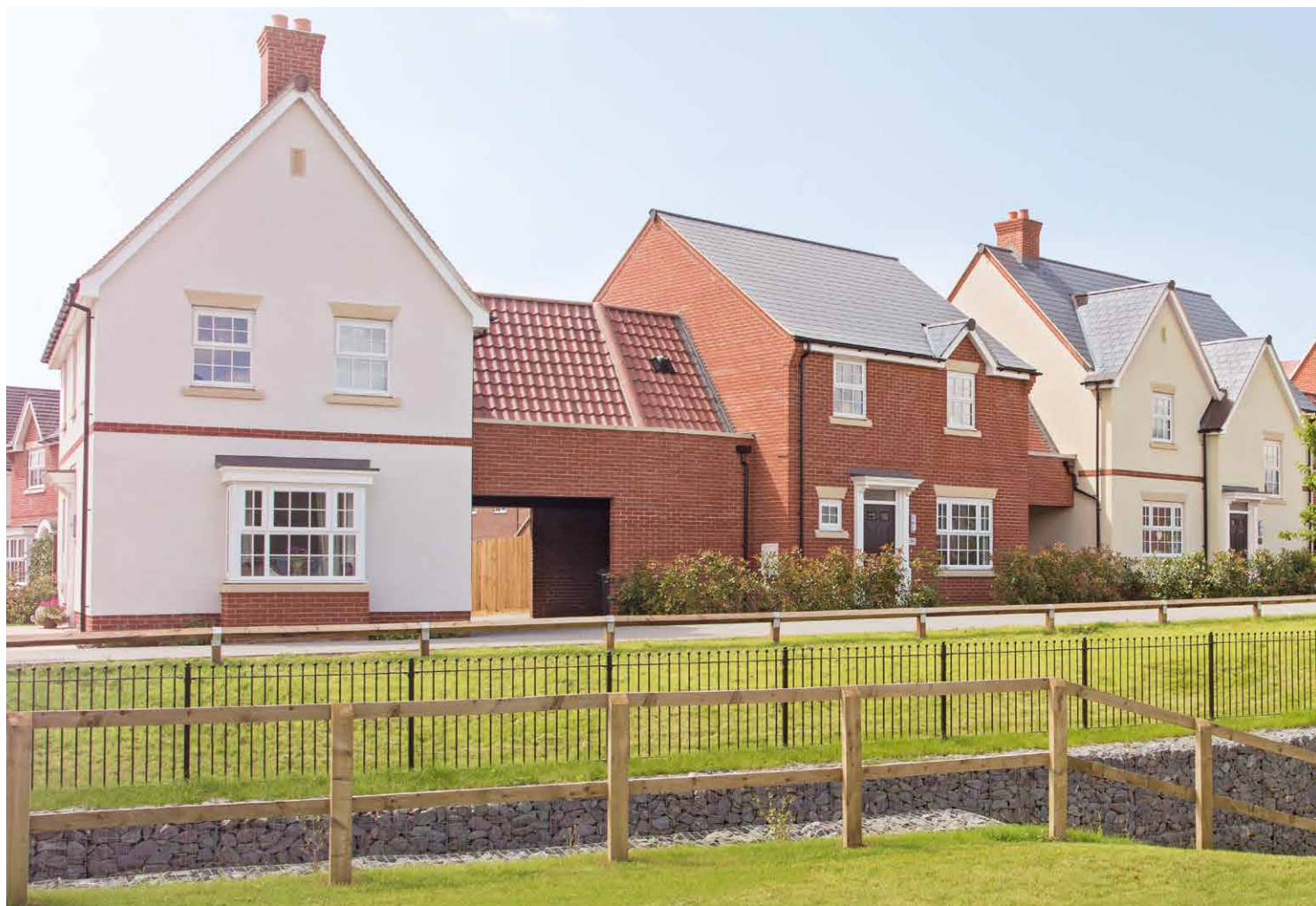
Above: Earl's Garden, Sible Hedingham

The attention to detail and quality of a Bloor home is like no other. Designed for comfortable, modern living, each home at Trinity Meadows is finished to a high standard, with fitted kitchens featuring integrated Bosch appliances and contemporary bathrooms with Roca sanitaryware and complimentary Hansgrohe fittings.