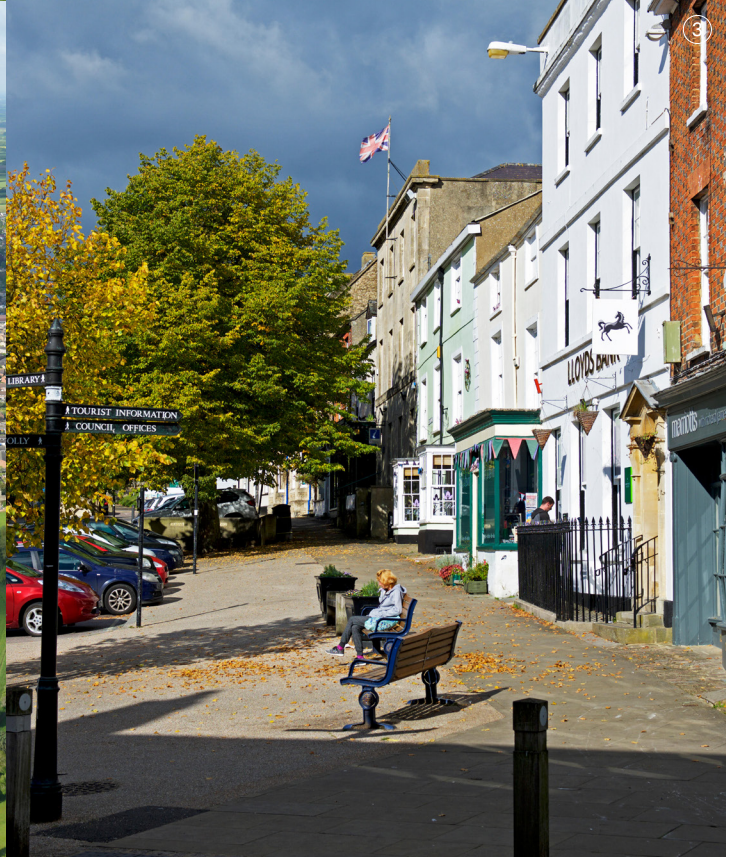
① → Street Scene at Oriel Gardens ② → Aerial View of Faringdon, Oxfordshire ③ → Town Square in Faringdon