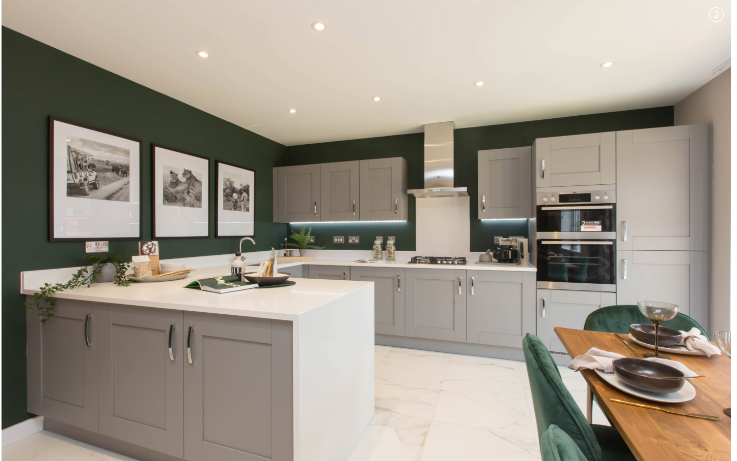
① ↪ Street Scene at Bluebell Green ② ↪ Typical Interior