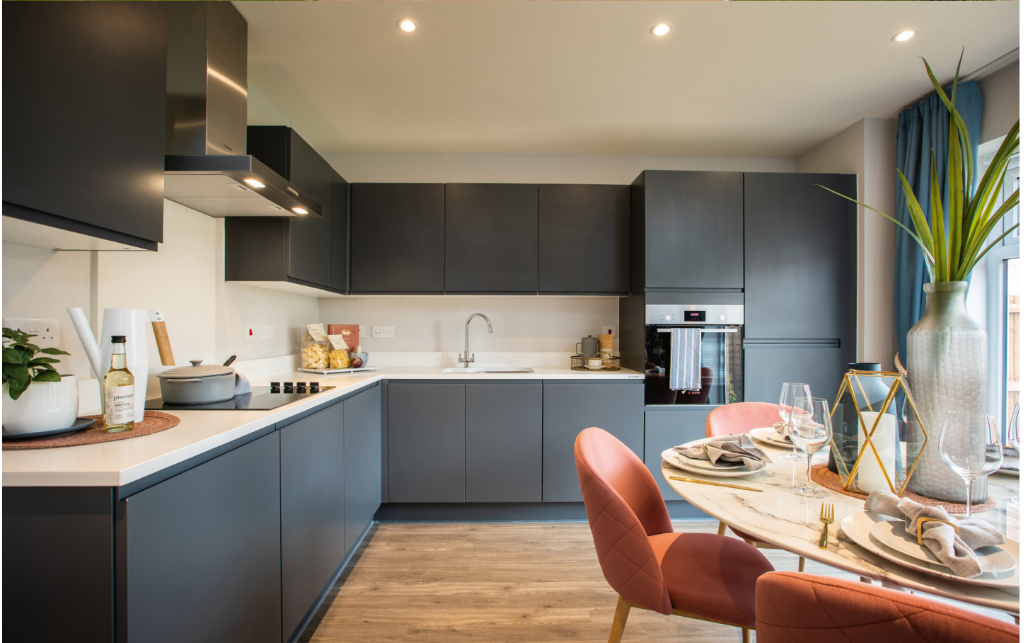
① ↳ Street Scene at Bluebell Green ② ↳ Typical Interior