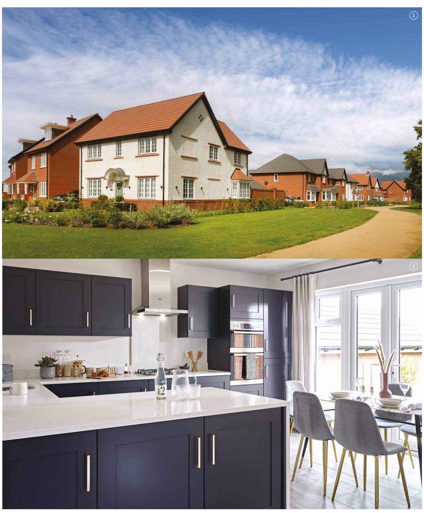
\bigcirc Bluebell Green \bigcirc > Typical Interior