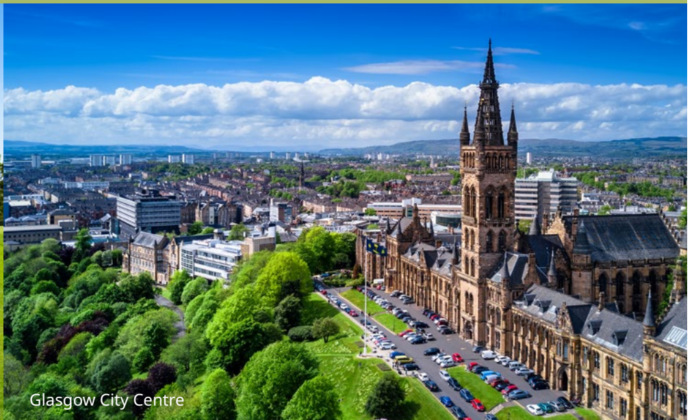
Glasgow City Centre