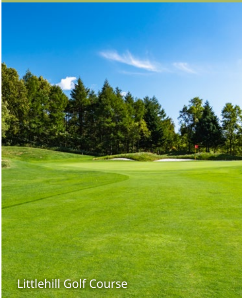
Littlehill Golf Course