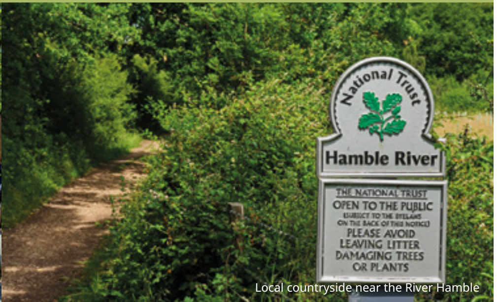
Local countryside near the River Hamble