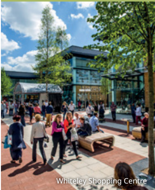
Whiteley Shopping Centre