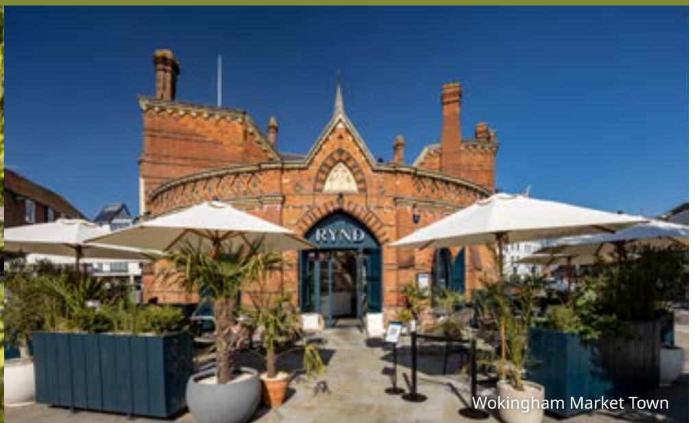
Wokingham Market Town