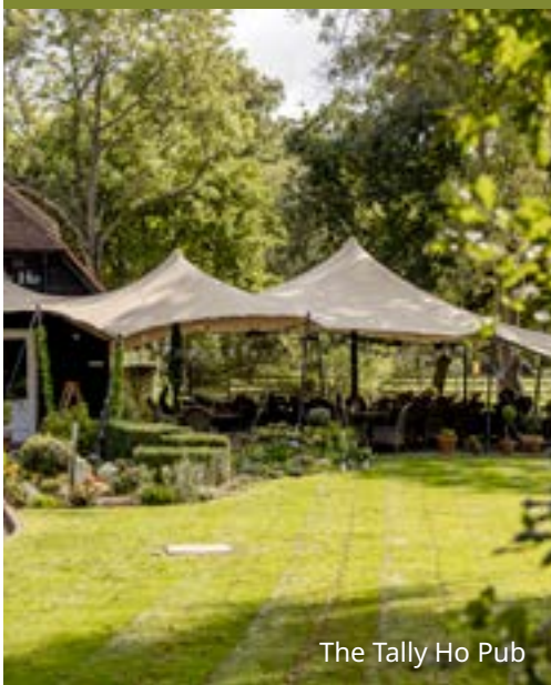
The Tally Ho Pub

With schools, a supermarket, leisure centre, community centre and open space all on your doorstep, a home at this attractive development provides the perfect balance for a better quality of life.