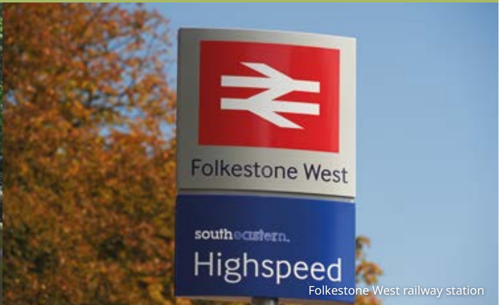
Folkestone West railway station