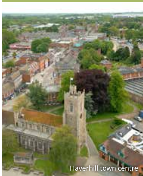
Haverhill town centre