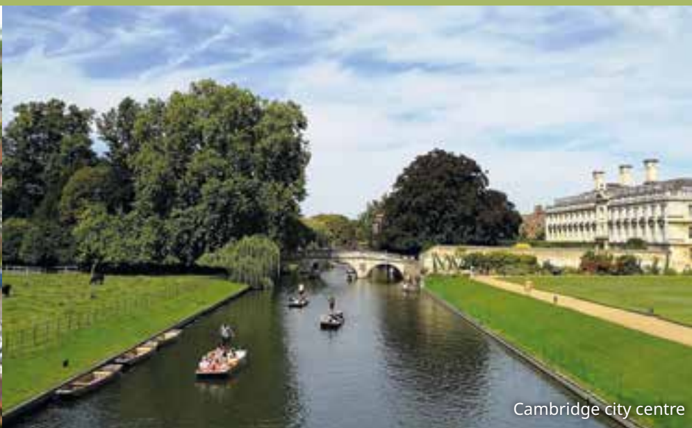
Cambridge city centre