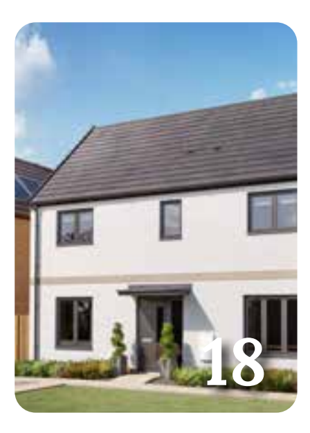
Take your next step