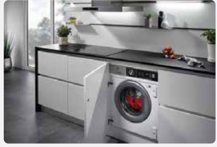
Options availability is subject to build stage of plots and options won't be available if plots have reached a certain build stage. Please contact the Sales Executive for further information.