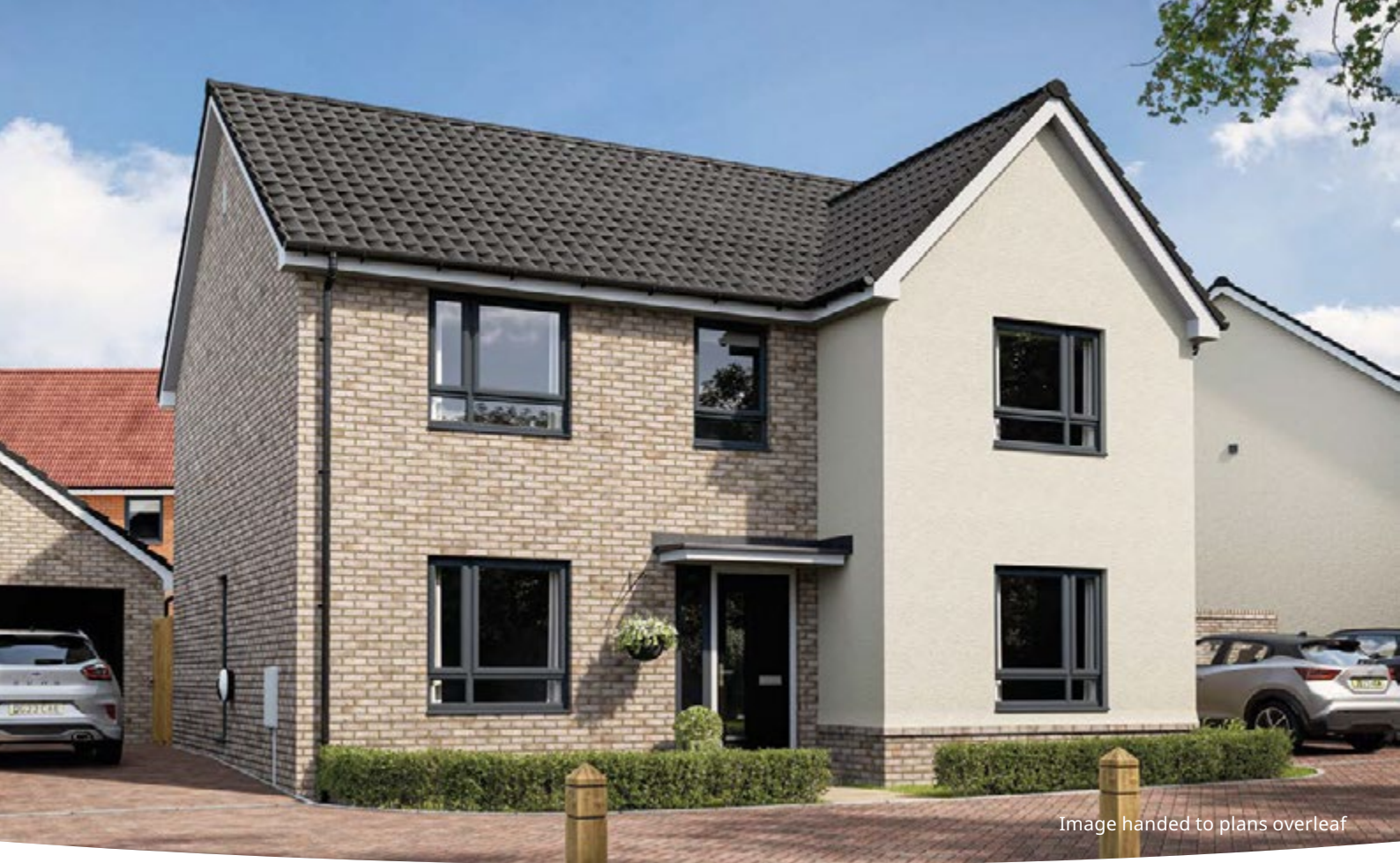
Image handed to plans overleaf