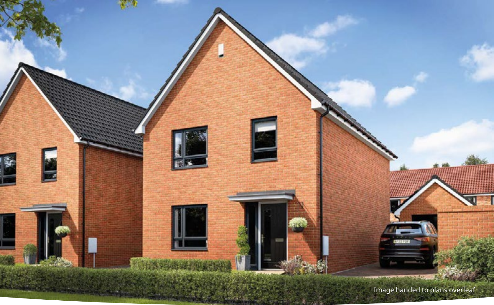
Image handed to plans overleaf