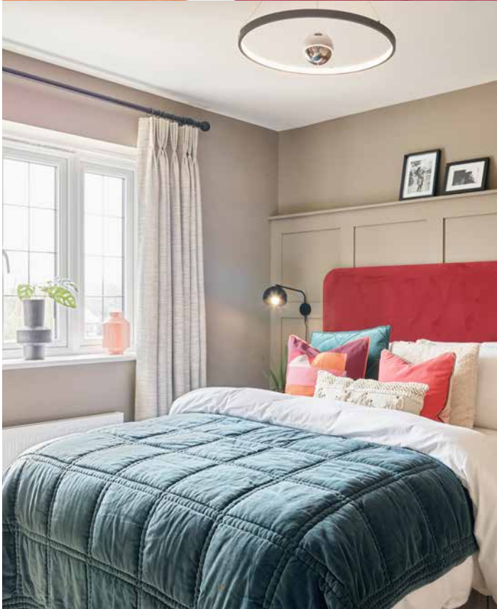
↳ Typical Interiors

And what's more, we'll keep on looking after you and your home long after you've moved in.