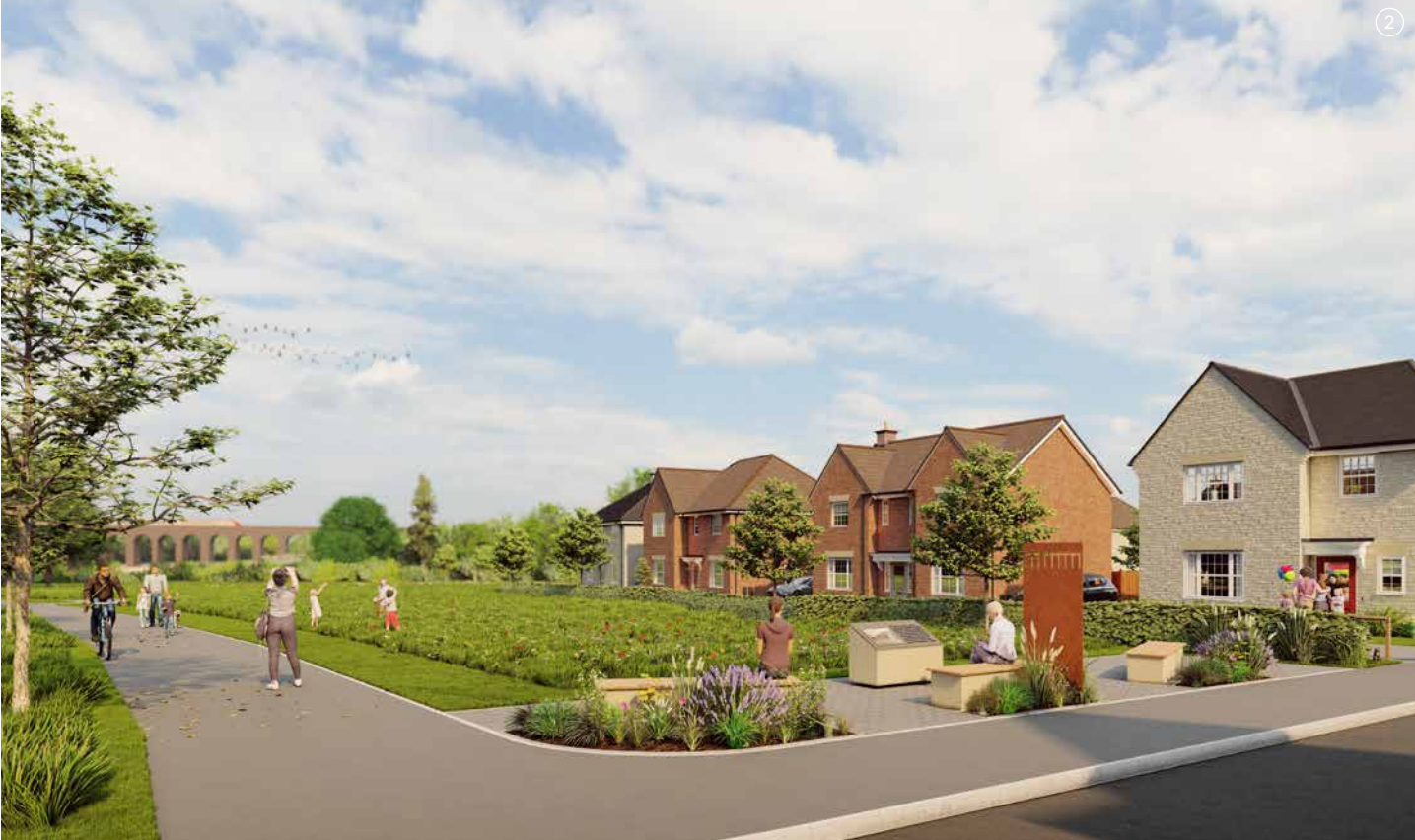
① ② ↳ Artists Impression of The Arches at Ledbury