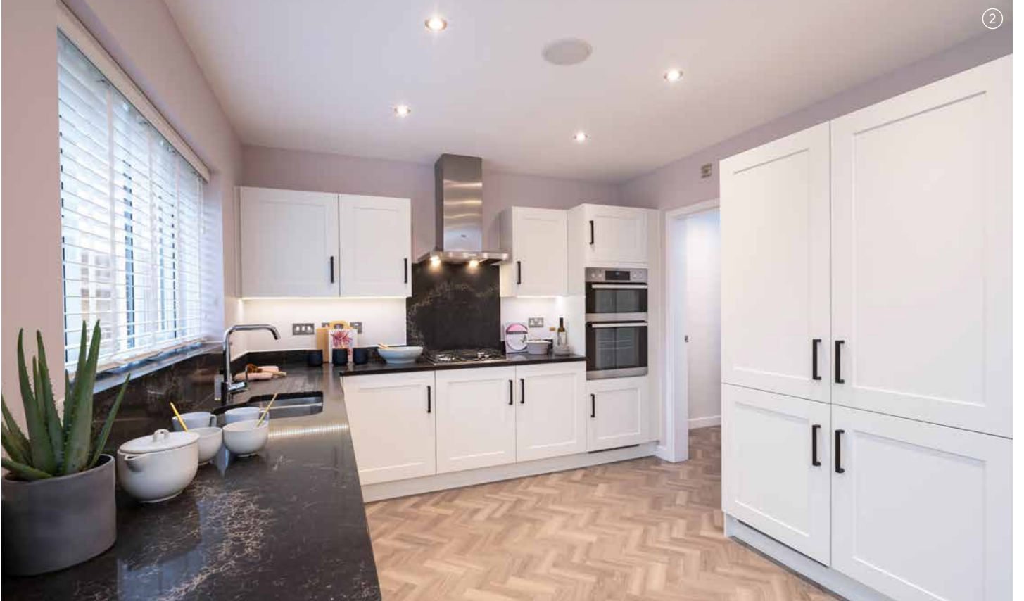
① → Wimborne Chase, Wimborne ② → Typical Interior