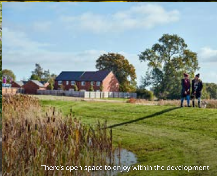
There's open space to enjoy within the development