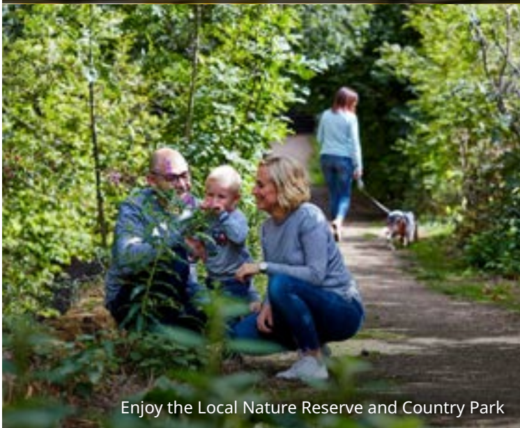
Enjoy the Local Nature Reserve and Country Park

Nearby city of Durham is full of historical charm