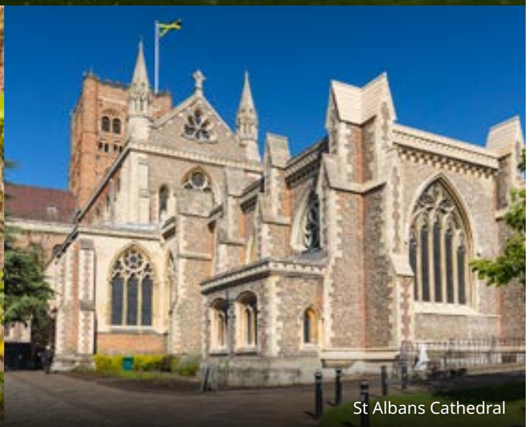
St Albans Cathedral