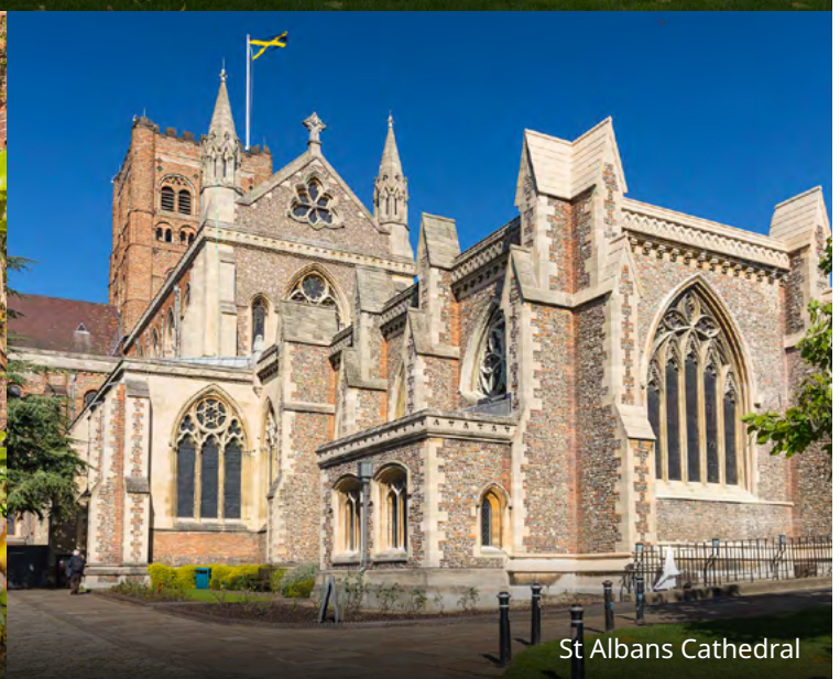
St Albans Cathedral