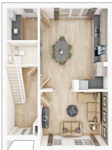
*plots 88 & 89

4 BEDROOM SEMI-DETACHED HOME, TOTAL 1,236 sq ft / 114.83m 2