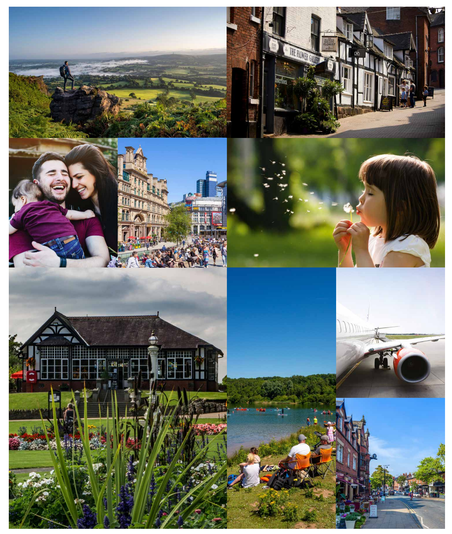
\hookrightarrow Images for illustration purposes only.