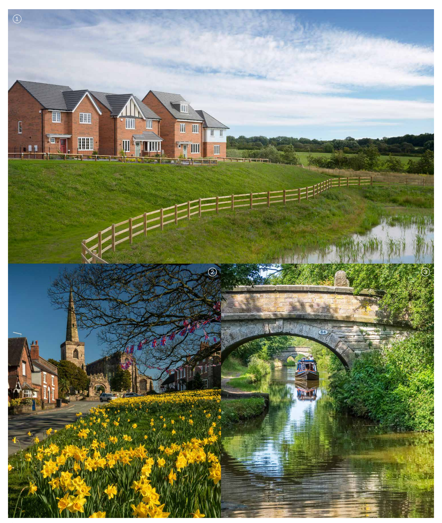
\overbrace{1} \hookrightarrow \mathsf{Typical} \; \mathsf{Bloor} \; \mathsf{Homes} \; \mathsf{Development} \;