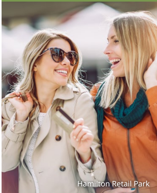
Hamilton Retail Park