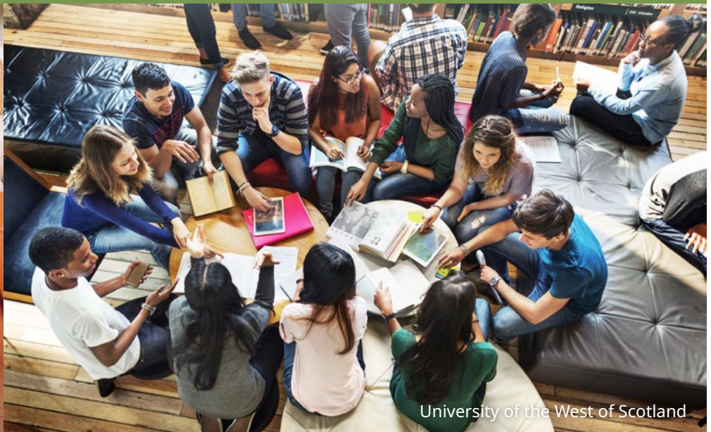
University of the West of Scotland