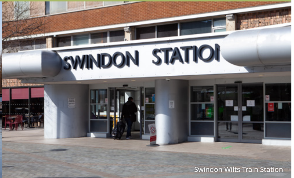
Swindon Wilts Train Station