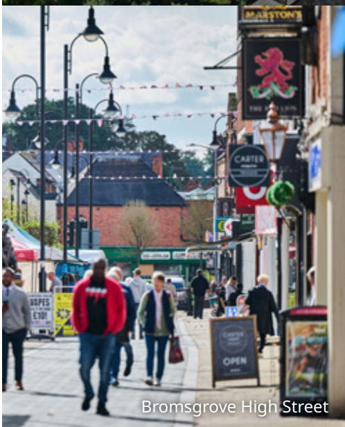
Bromsgrove High Street

Drone shot of Sanders Park and surrounding area